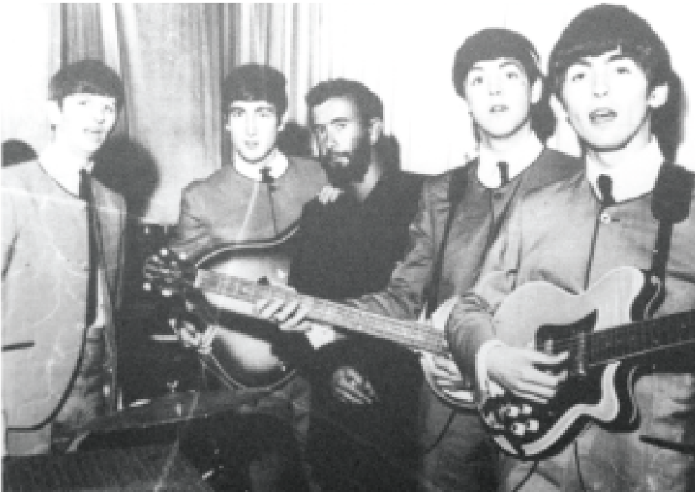
Ellis (center) in Liverpool was backed by Beatles.