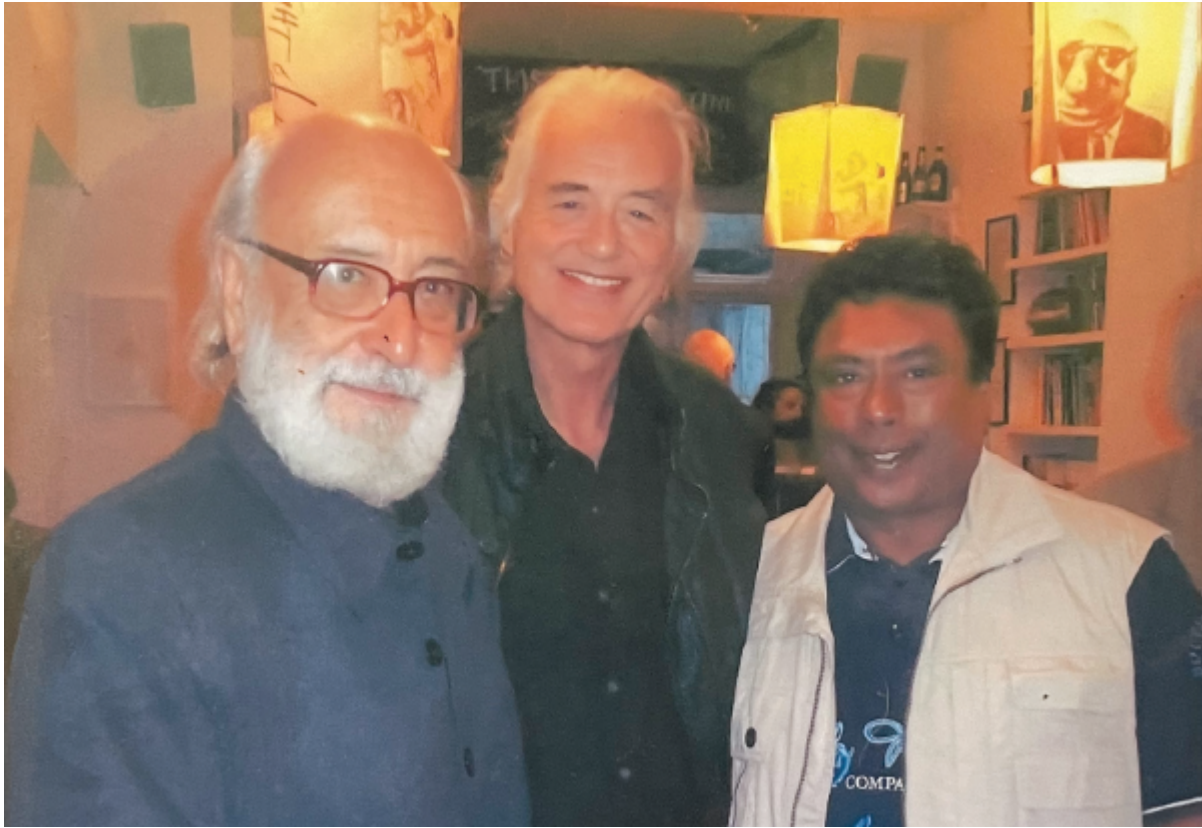
Royston Ellis, Jimmy Page and Neel Jayantha at Royston's Poetry Reading at The Poetry Cafe, Covent Garden, London, England, May 2015.