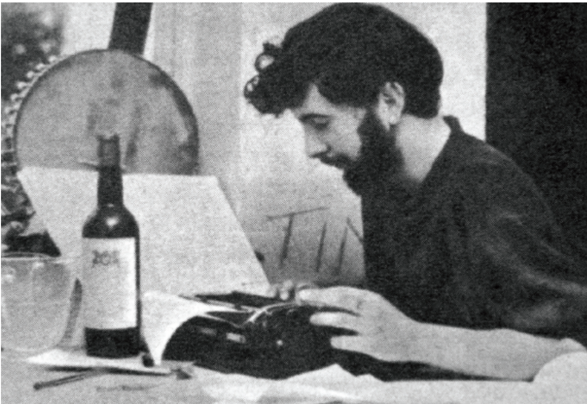
Royston Ellis beat poet at work.