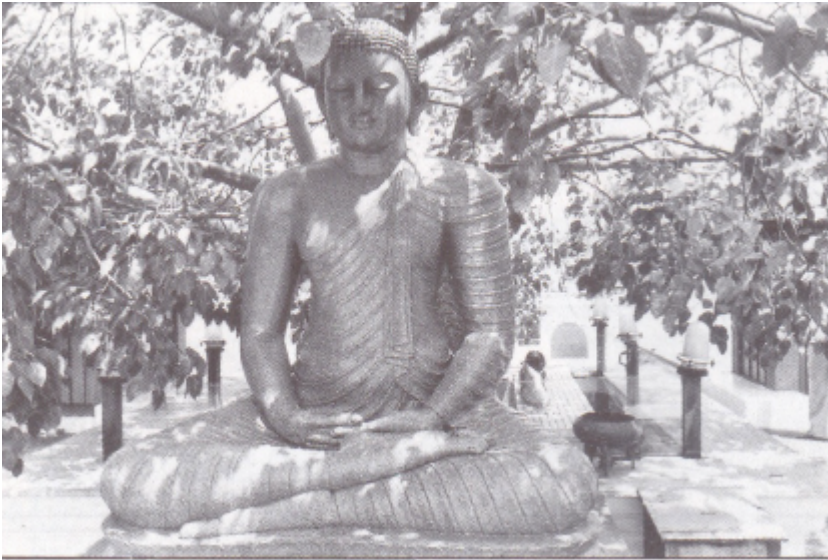
The statue of the Buddha in meditative pose.

The architectural forms of this “chapel” have gone through a long and varied process of historical evolution before assuming the present functional type. However, in its ultimate transformation, it has retained the basic architectural features of a terraced enclosure, with unrestricted accommodation within for the seating of at least 20 to 30 Buddhist monks on the floor.