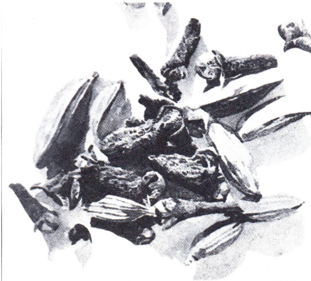
Cardamoms and cloves - two of the spices for which Sri Lanka is well known.