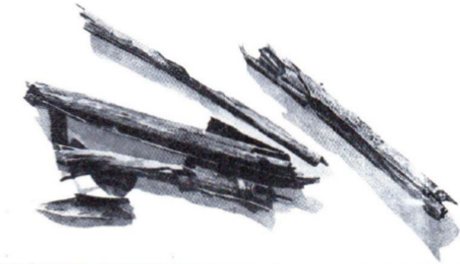
Cinnamon - from early days one of the most coveted of spices.