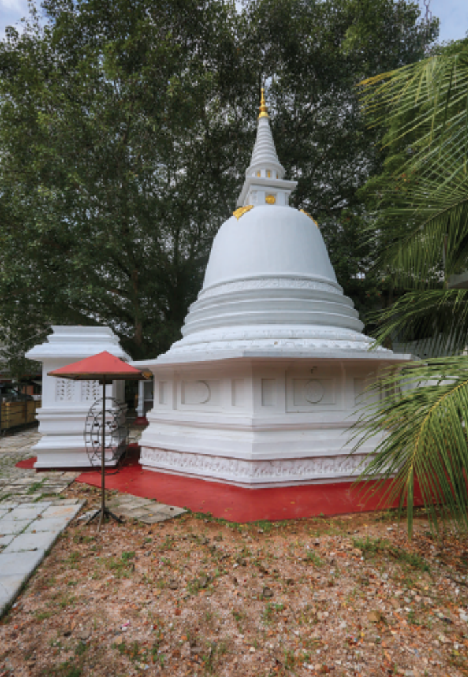
The dagoba and the Bo tree create a peaceful aura.