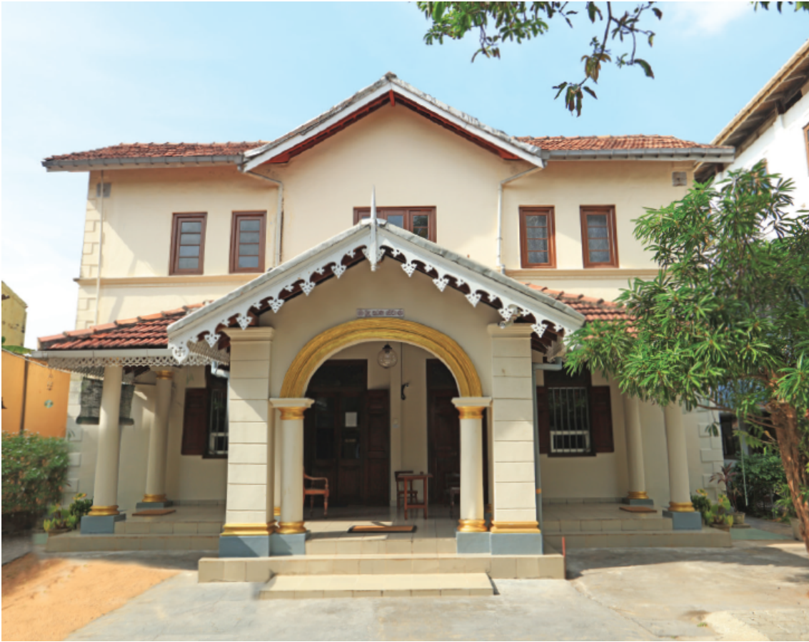
The avasaya has been home to many knowledge seeking bhikkus.