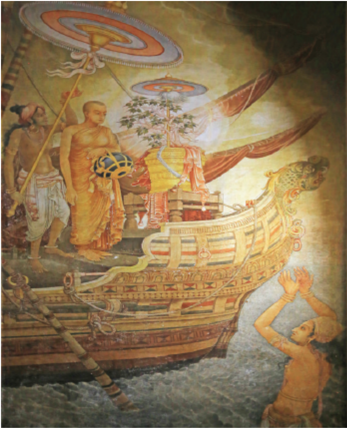
Solias Mendis's painting illustrating the arrival of Sangamitta Theri with the sacred Bo sapling.