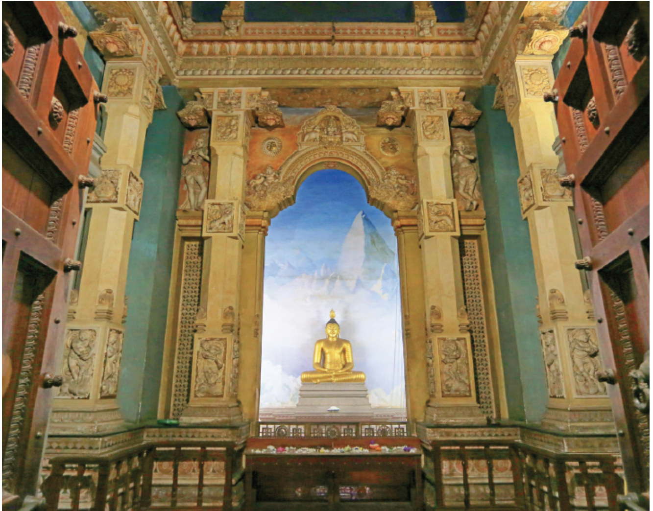
The intricate detailed work of the inner shrine.