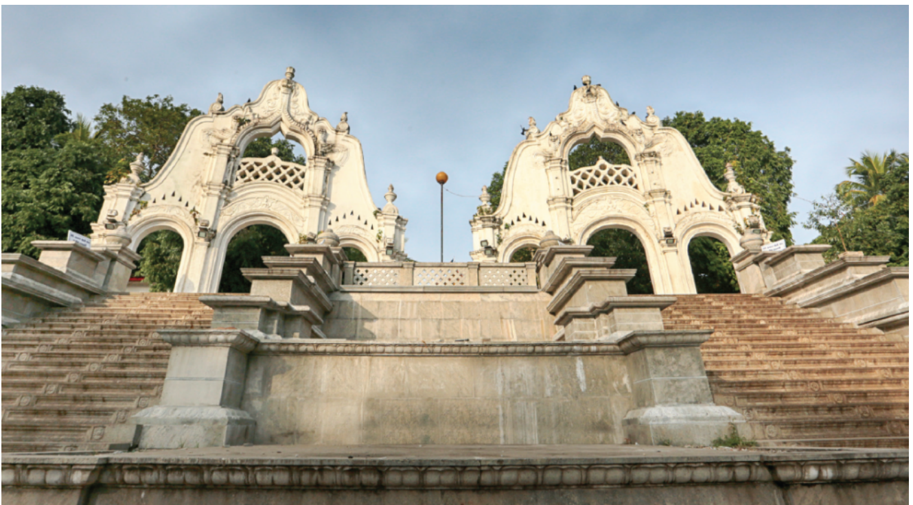
Entrance to the main shrine flanked by the guardian deities.