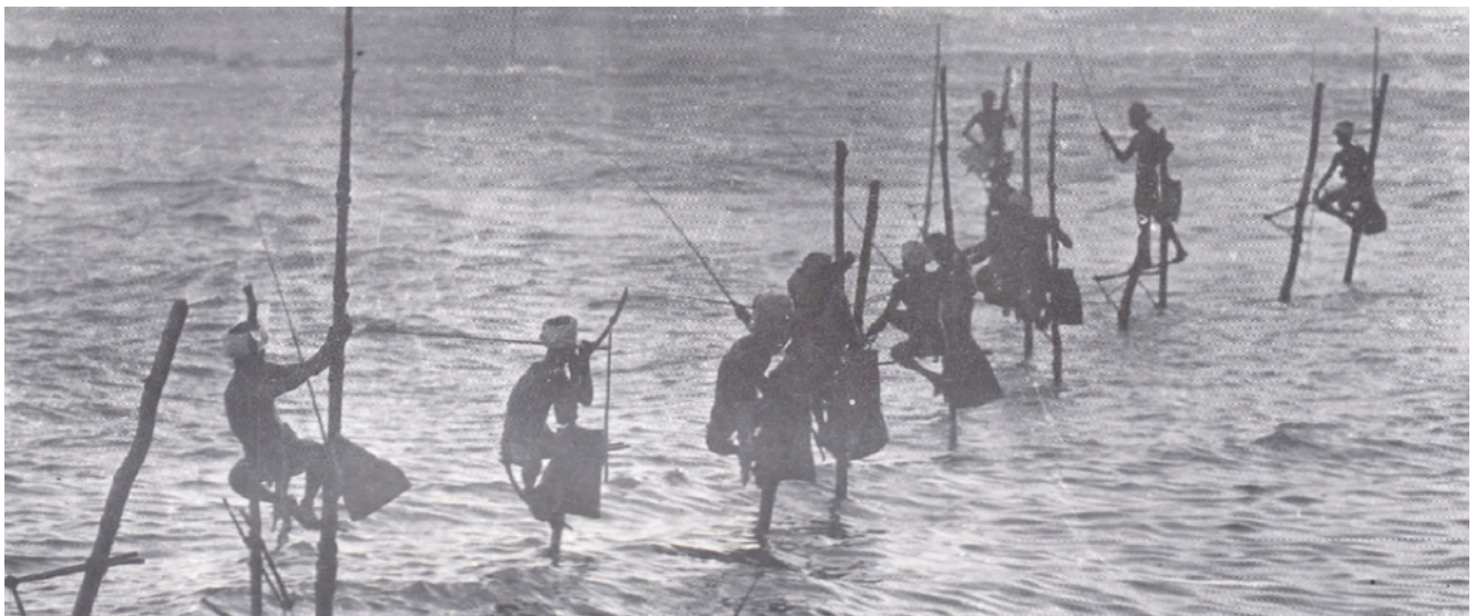
Patience with the rod and line. Fishermen on stilts at Weligama.

Discover Sri Lanka and explore a land with sunshine throughout the year.