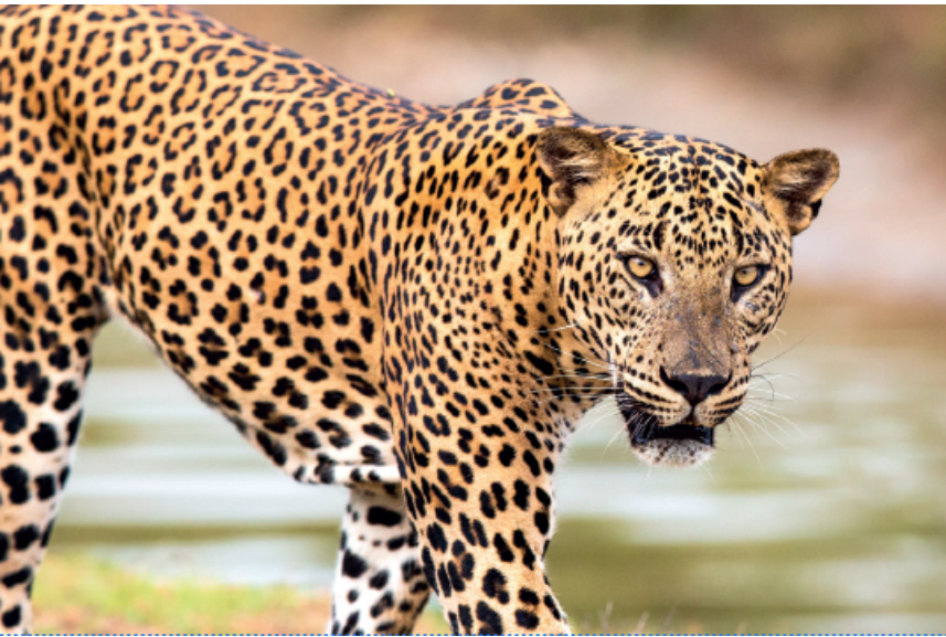
In their territory, at Yala.