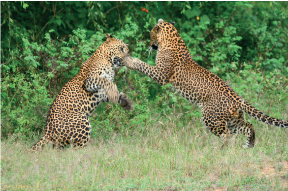
An incredible capture.