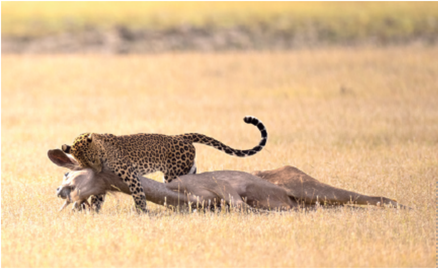
It's my prey.