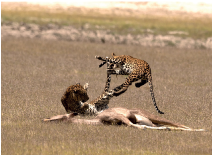
Hunting in Wilpattu.

Just one of these magnificent species is the powerful leopard, all in a land where a wildlife lover can lose oneself in wonder: Sri Lanka - the wondrous Land of the Leopard.