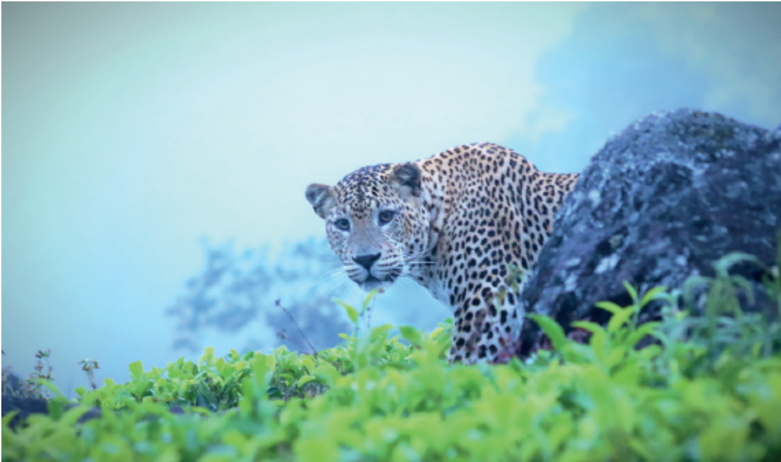
Spotted in the Tea Garden.