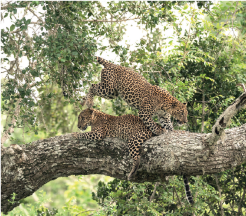
In their territory, at Yala.