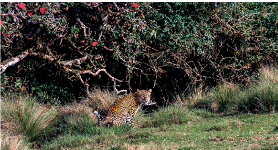
Leopard at Horton Plains.