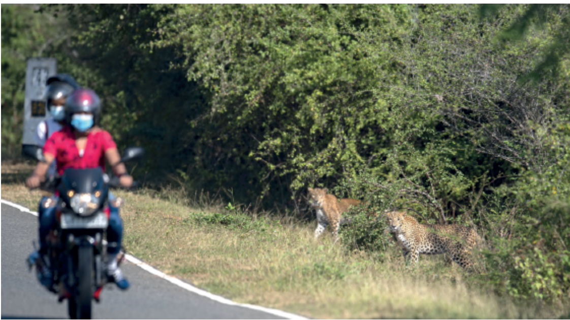
Spotted near Buttala Kataragama Road.