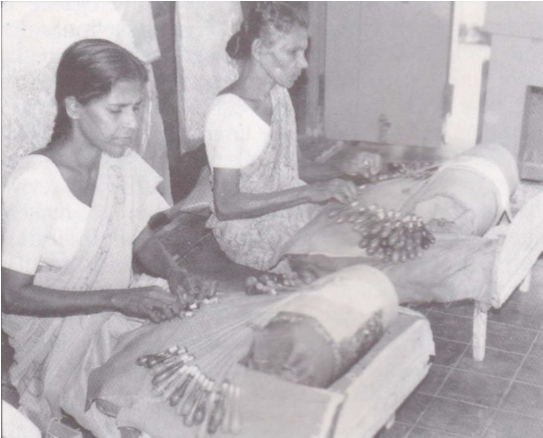
Nimble fingers at the Beeralu pillow, weaving the thread into myriad designs.