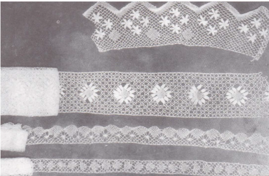
Edgings and trimmings of lace in different motifs.