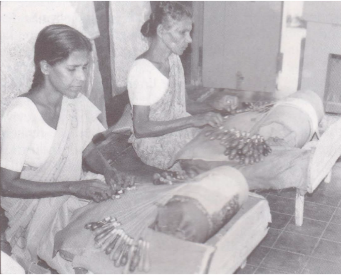
Nimble fingers at the Beeralu pillow, weaving the thread into myriad designs.