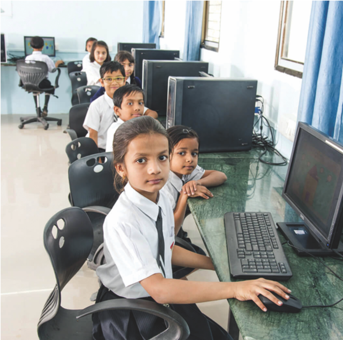
New education system.