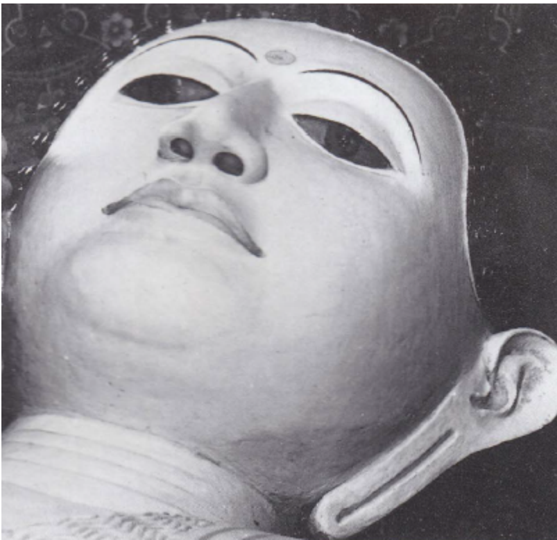
The face of the famous statue of the Buddha with the Sapphire eyes at the Subhodharama. Karagampitiya.