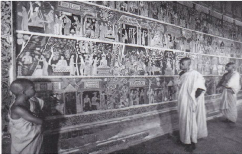
Section of the wall of the temple covered with Buddhist frescoes.