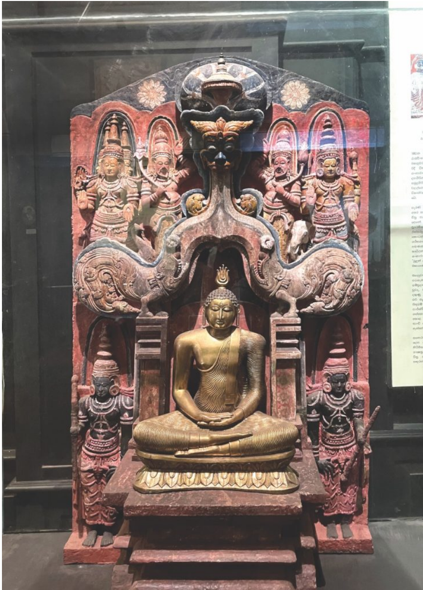
A skillful detailing of a Samadhi Buddha statue under a Makara Arch.