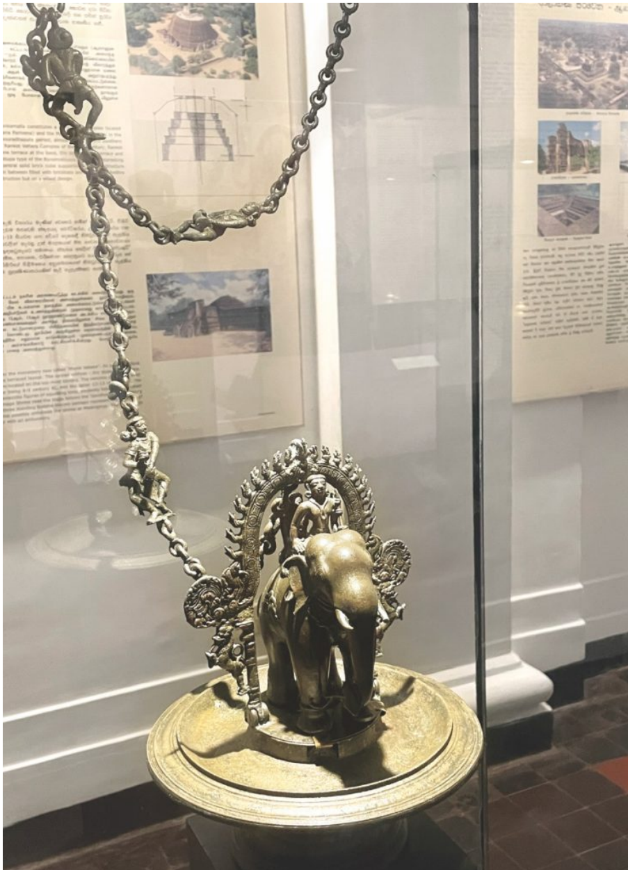
An impressive Elephant Lamp built with hydraulic features.