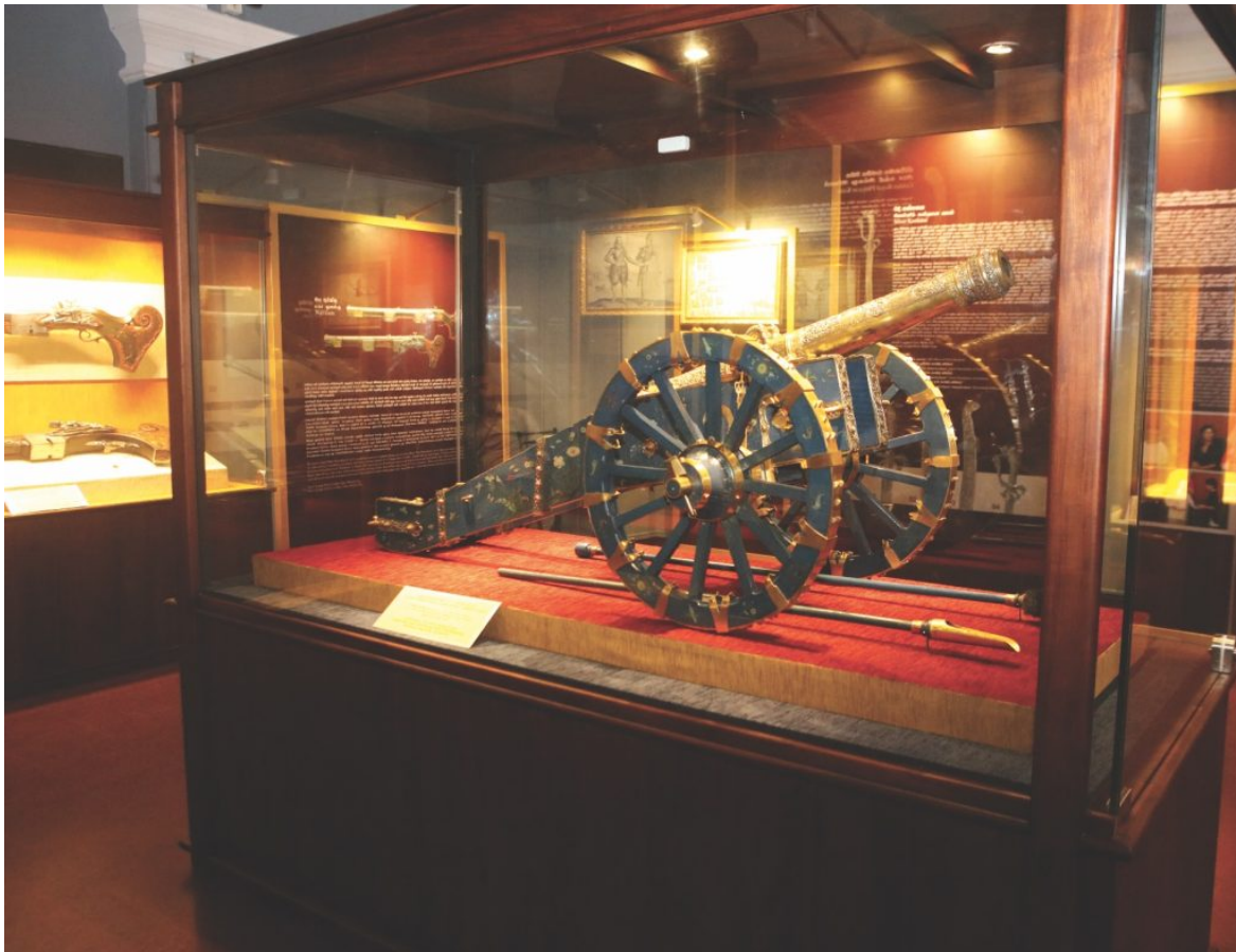
The return of a historical canon from the Netherlands is on display at a new gallery.