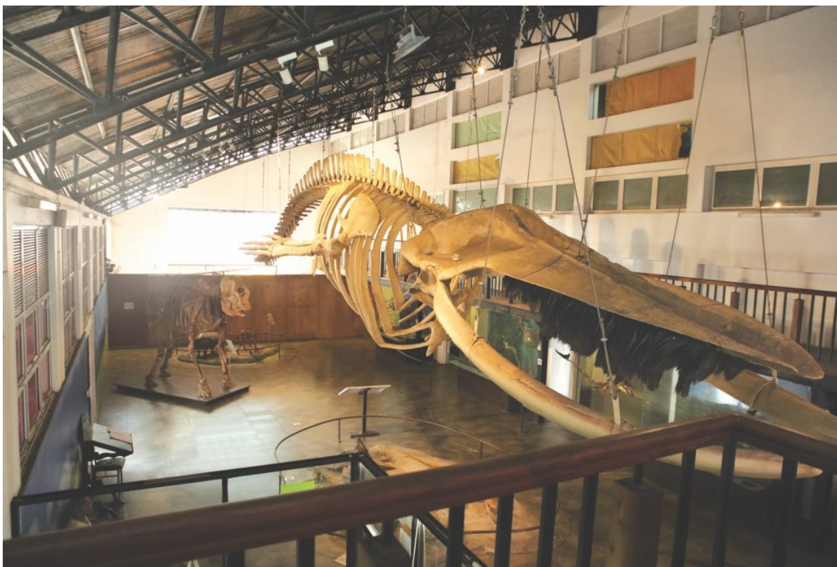
An awe-inspiring gigantic display of the blue whale skeleton.