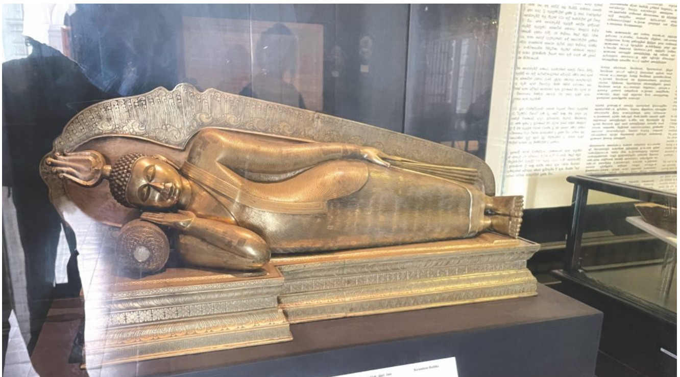
A tranquil recumbent Buddha sculpture from the 18 – 19th century.