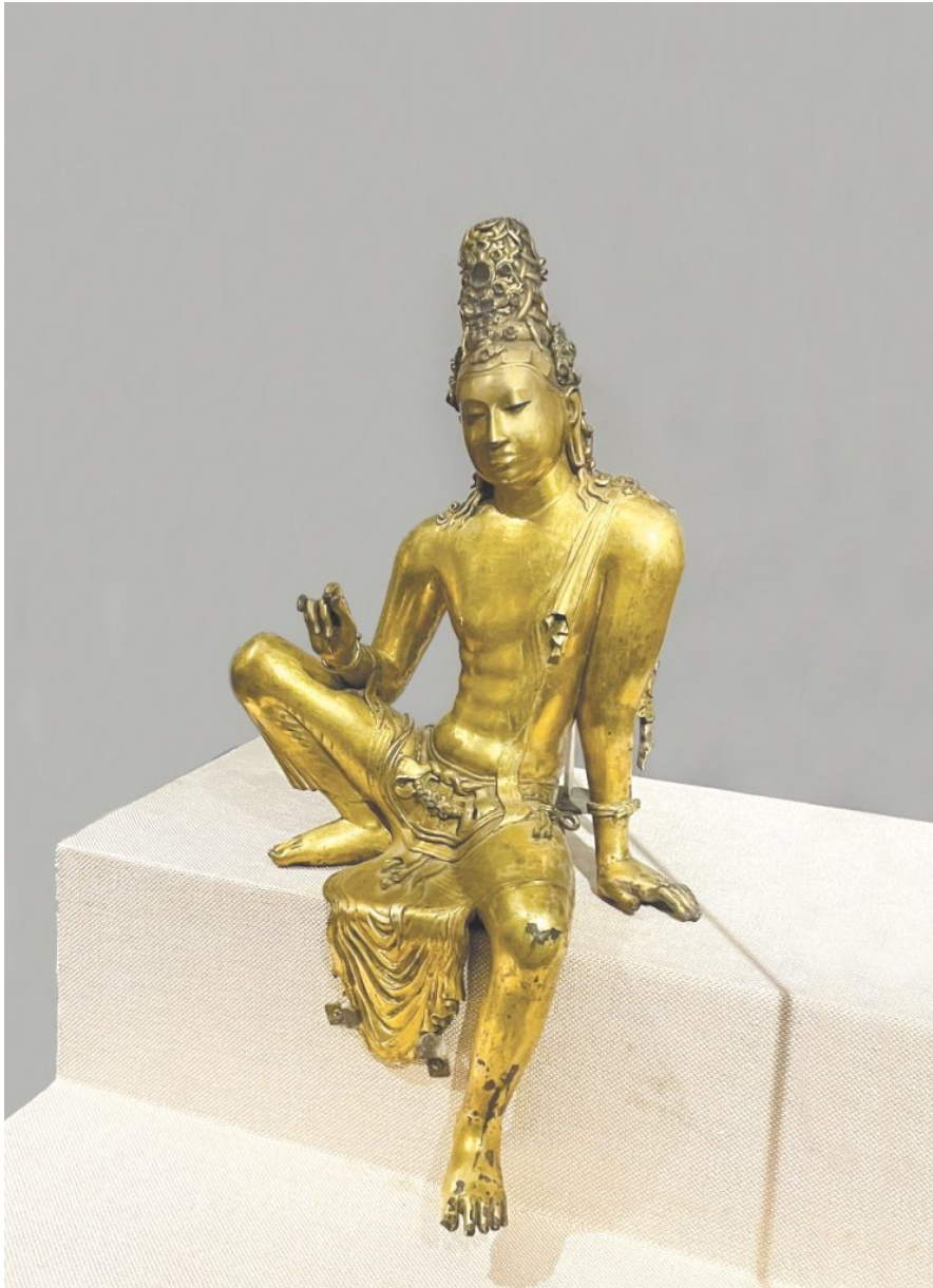
A masterpiece of Bodhisattva Avalokitesvara.

Back into the Museum, huge two-paneled Burma teak doors nearly ten meters in height mark the entrance. The entrance welcomes the visitor to the serenity of a limestone Buddha image from the eighth century in Samadhi, moving the visitor into joyful calm and bliss. The wooded bifurcated staircase majestically winds to a midway landing and separates into two narrower stairs to the right and left, leading to more exhibits. The Colombo Museum has fifteen galleries, beginning with the pre and proto-historic periods, that give a glimpse of ancient humans on the island before the fertile periods when royalty reigned. There are dedicated galleries for the Anuradhapura, Polonnaruwa, and Kandy periods, while the transitional period showcases artifacts from short-lived kingdoms in Sri Lanka. Galleries one to five have been arranged in historical sequence, while six to fifteen display various collections that include art and crafts, stone antiquities,