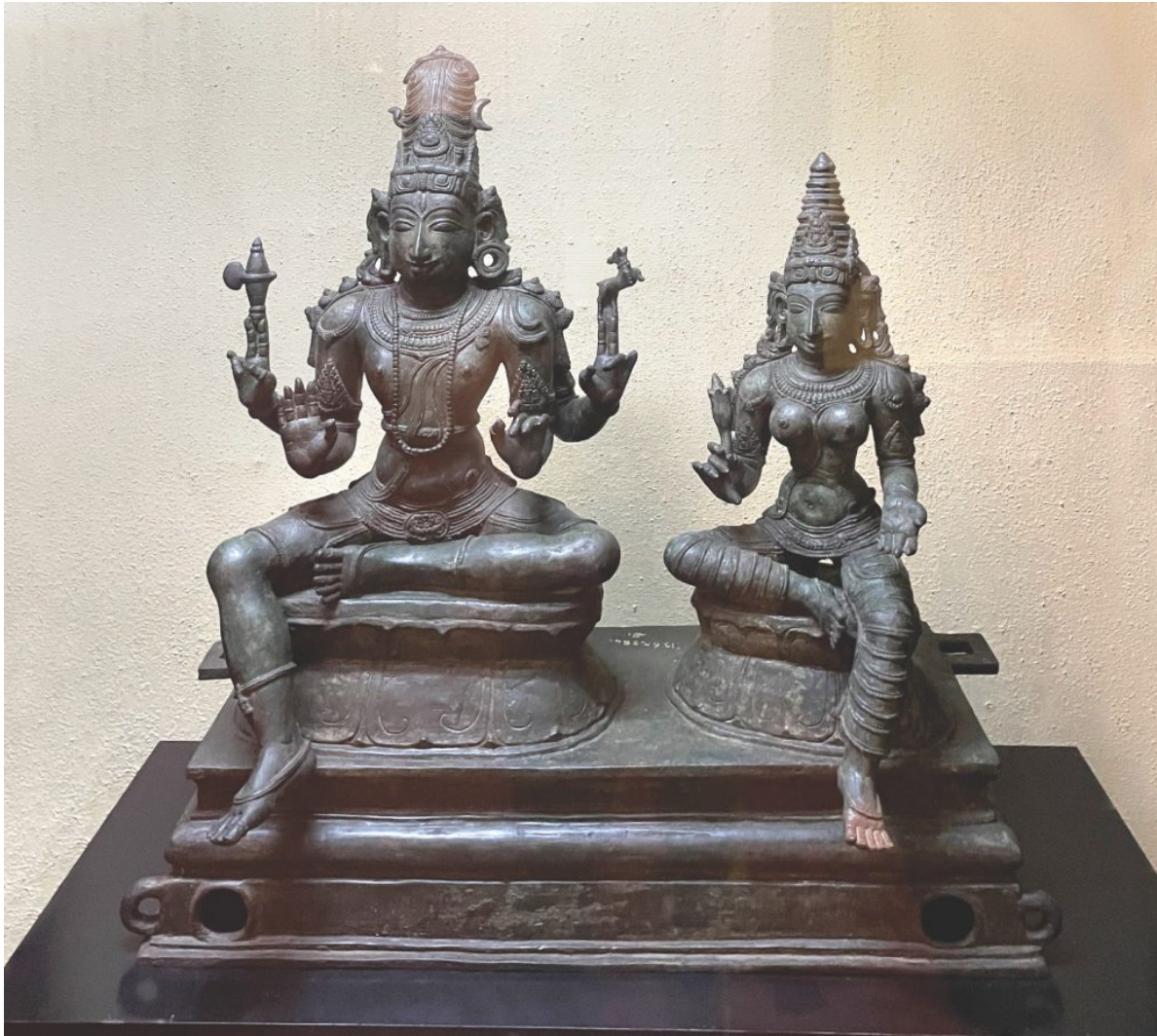
Sculptures of deities Shiva and Parvathi evoke divinity.