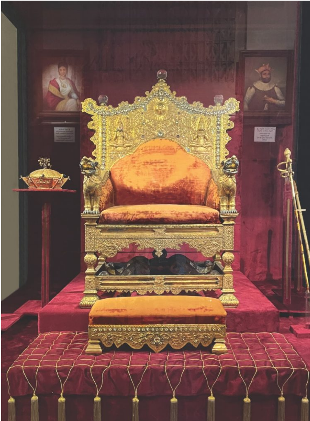
The Royal Seat is among the many popular belongings of the Kandyan era.

providing picturesque aesthetics of its chequered periods through peace and prosperity, and conflicts. In design, the Museum is an unmissable imposing landscape in Colombo.