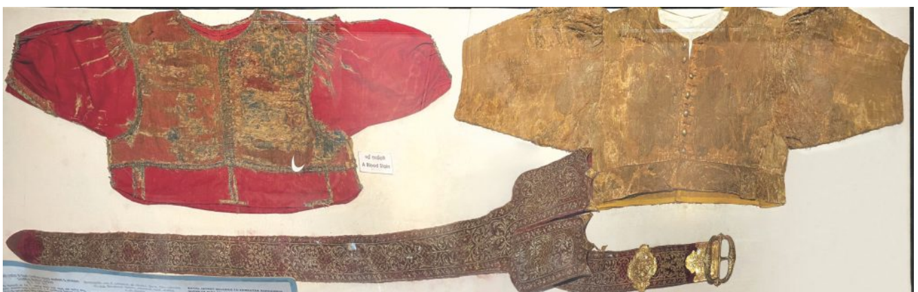
On display are a royal belt and upper garments worn by the last king and queen of Sri Lanka, with the blood stain on the queen's jacket.

The Transitional and Kandy periods focused on brass-based images of the