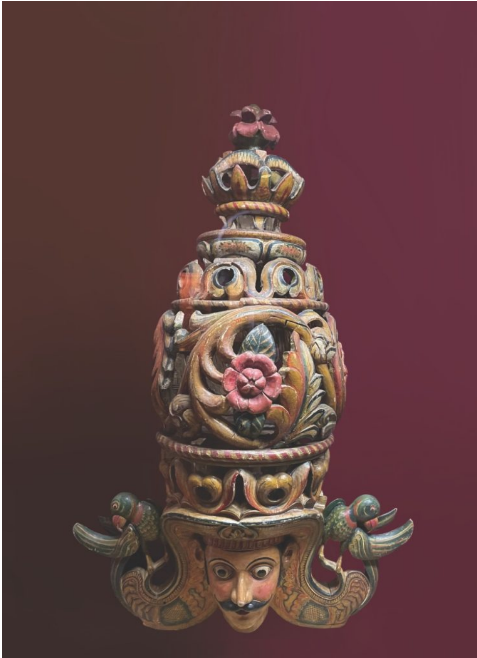
Masks featuring artistic patterns.