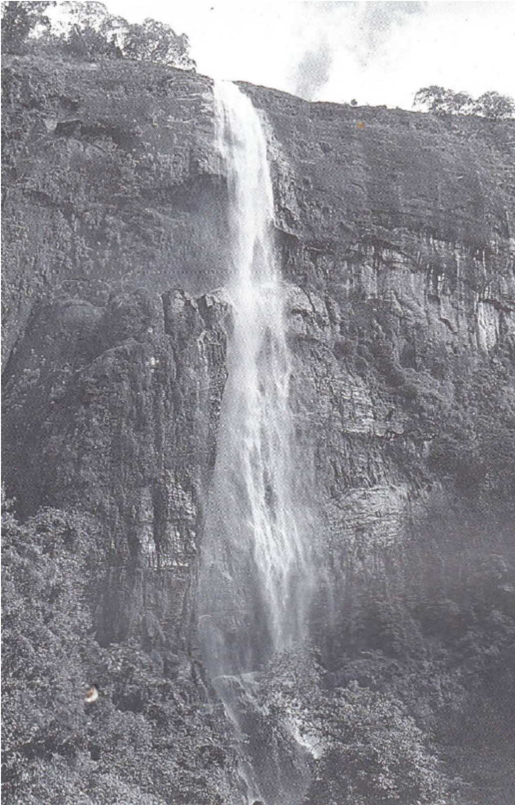
Cascade of beauty: the Diyaluma Falls.