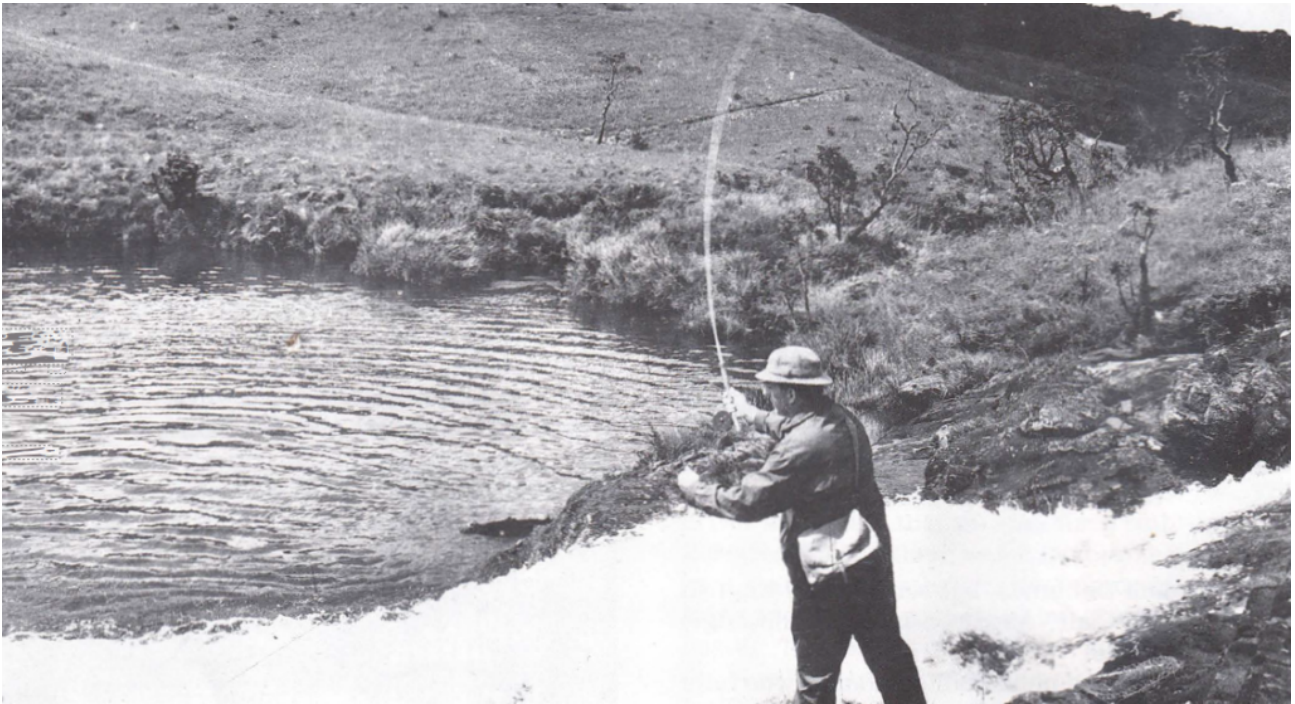
At the trout streams at Horton Plains.

to the ancient Kings of Lanka when invasion or out palace feuds threatened them. The hills provided a natural fortress and hideouts. From the mountains we gradually descended homewards, through Kandy which still retains most of the medieval traditions of the Sri Lankan kings and the main gateway to the tree and forest covered beauty of the mountains.