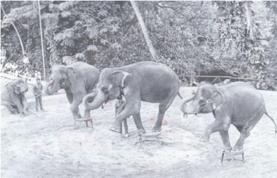
Jumbos performing at the Zoo.