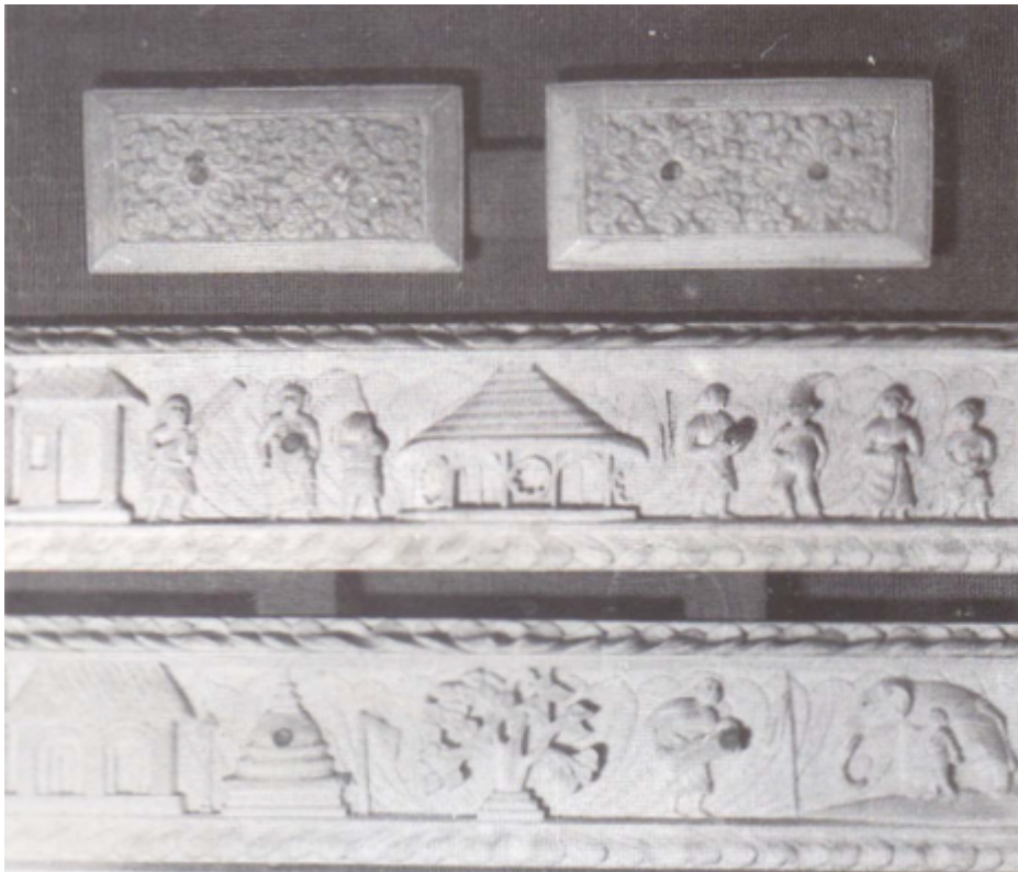
Panels of intricate carvings on ivory.

History also records that of such excellence was this craft that no less than a king of Lanka, Jetthatissa II (circa 331 - 340 AD.), was an “extraordinarily skilful” ivory carver. “He carried out many difficult works and taught the practice of his art to many people...he made a beautiful, charming figure representing the Bodhisattva as beautiful as it had been produced by miraculous power, as well as a chair of state with a back, an umbrella, a mandapa (hall) with jewels. Here and there (were) all kinds of work by him splendid ivory.