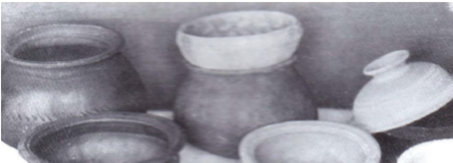
Clay pots and covers used in the traditional Sri Lankan kitchens