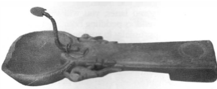
An antique coconut scraper with ornate carvings - now a museum piece.

But give her a nice, cosy kitchen with a wood fire, all the clay pots she needs and the rudest of utensils-and of course the ingredients - she will, with great regularity, reward you with the most wonderful meals imaginable. One must never interfere with a cookie. Even a gentle suggestion about how much chilli to add to the fish-curry can earn you a muttered threat or a look of utter scorn. Just leave her alone, or better still, with a male helper. The right kind of male helper does much to improve the flavour but can delay the meal preparations as well. The wrong kind of male helper can ruin a meal. Choose your men with care and if you like, get the cookie's approval.