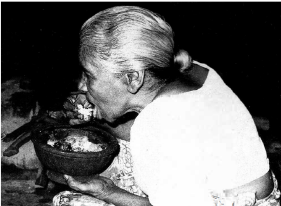
A cookie settles down to her own meal in a clay adiwalandu seated in front of the fireplace in the kitchen.

Multitudinous articles and many books are in print which concern rice and curry food. The main thing is that rice and curry means simply more rice than curries. More curry than rice is a very unhappy and civilised sort of offering to a nervous eater. The average rice and curry, Sri Lanka style must have at least five different additions, not all of them curries to interest a Sri Lankan. More fastidious gourmets insist on ten. I know families in the Deep South who literally conceal miniature mountains of delicious brown, unpolished rice with an incredible