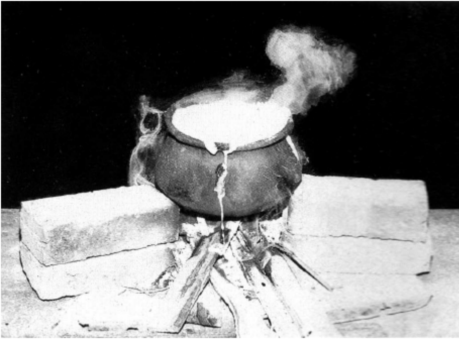
A pot of rice boiling on a typical Sri Lankan hearth.