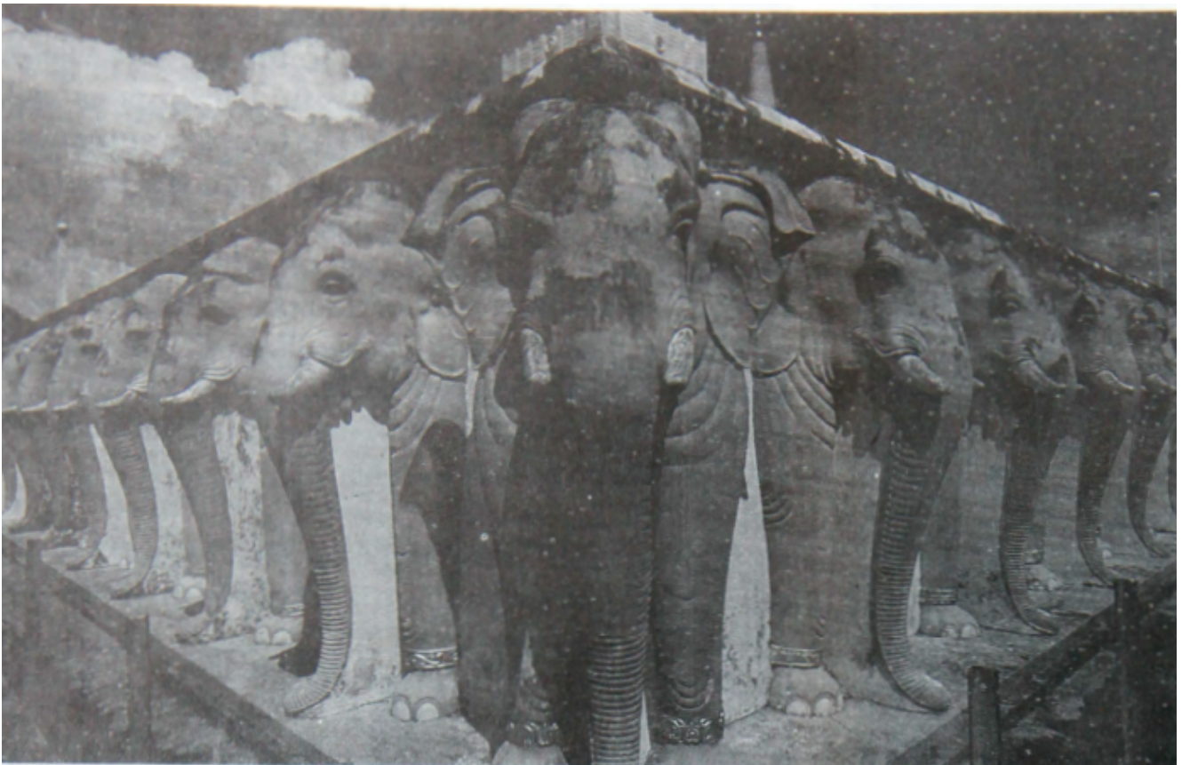
Elephants stand shoulder to shoulder around the base of Ruvanveliseya dagaba.