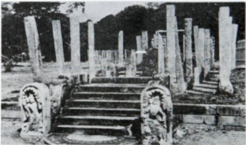
Dalada Maligawa, the Tooth Relic Chamber at Anuradhapura.

granite pillars that once supported a Buddhist monastery with more than 1000 rooms occupying nine storeys. It had a roof of beaten copper, from which comes its name. To the Sri Lankans Buddhists of today, the Ruvanveliseya, the mighty dagaba - largest such building in the world-is almost synonymous with Anuradhapura. (A dagaba is a repository of relics). It is the classic among dagabas. Built in the 2nd century B.C. in the shape of a water bubble, the magnificent white dome rises to a height of 77 meters with a base 53 meters wide. Modern engineers who undertook the restoration in the early 1940s, found it necessary to flatten the shoulder of the dome, thus sacrificing the perfection of the the original shape, and falling short of the original height. It, as two other dagabas in Anuradhapura, rivals the ancient pyramids of Egypt in size.