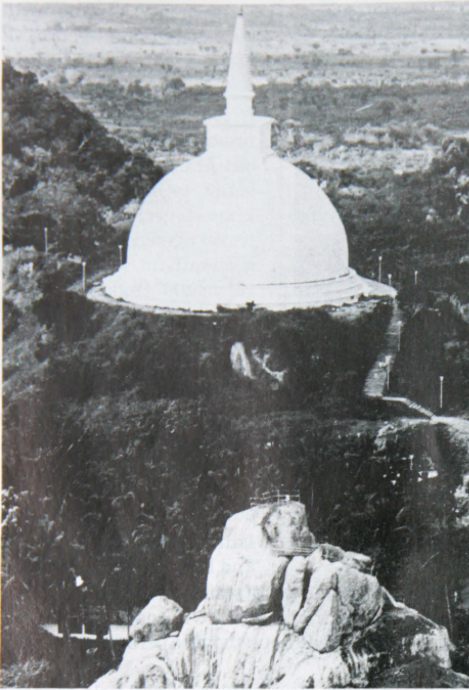
Mihintale, where India's Emperor Asoka preached the first Buddhist sermon in 247 E.G.