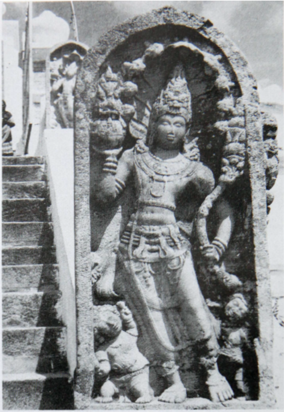
Detail of a guards tone at Thuparamaya.