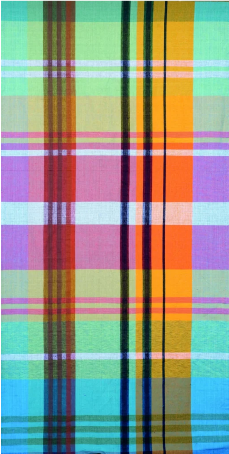
'Jaffna Causeway '