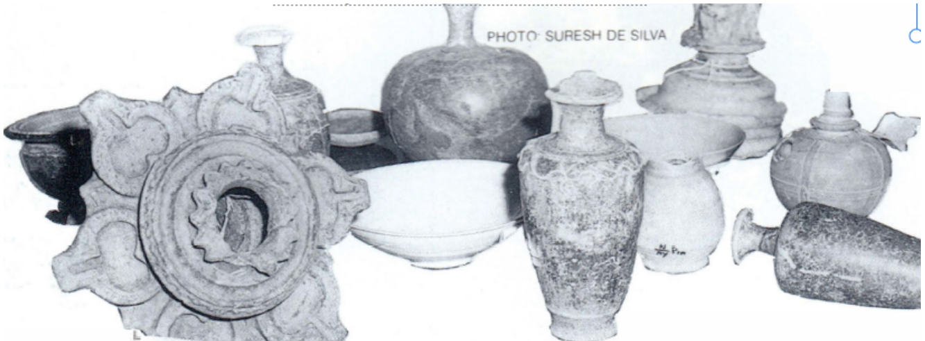
Artefacts from the cultural triangle, touched by the Silk Road.