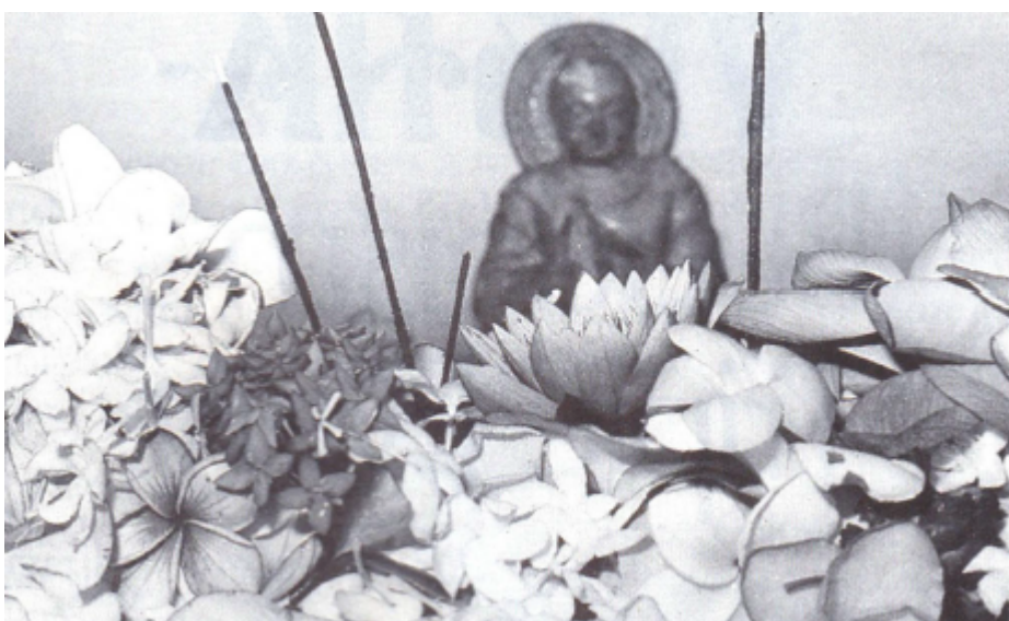
Joss sticks add their fragrance to the mountains of flowers offered to the Buddha