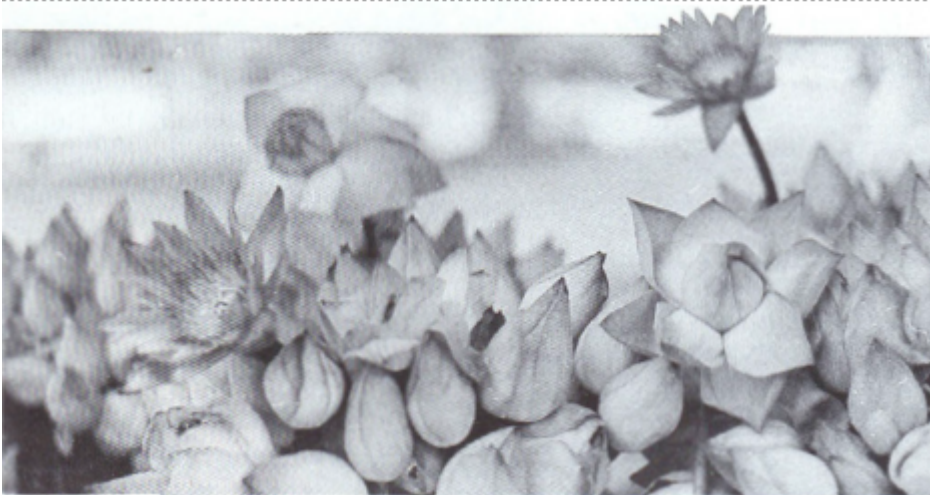
A host of pink lotuses offered to the Buddha on Vesak