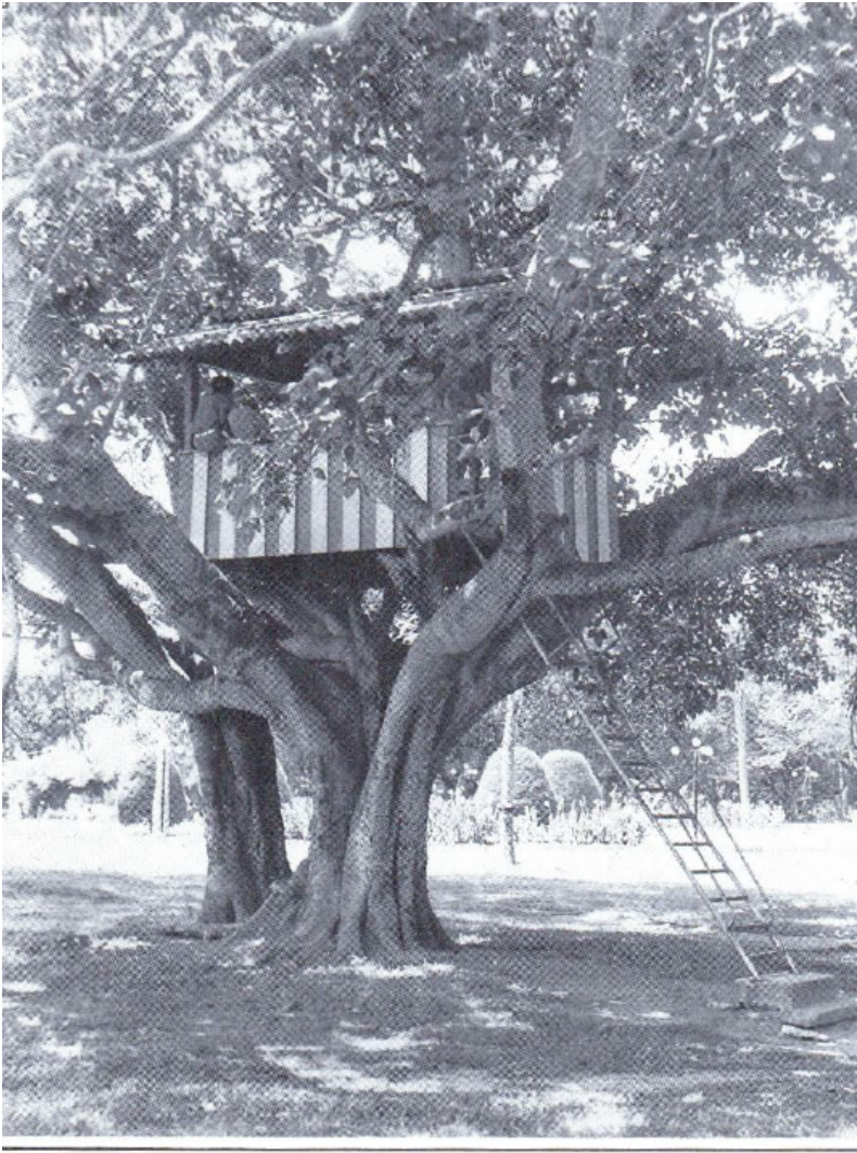
The tree-house at the Park, a favourite place for the many children who come here.