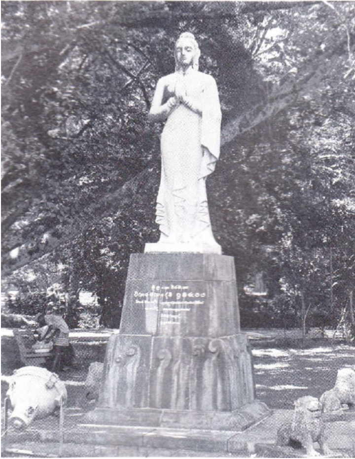
Statue of Vihara Maha Devi at the park.