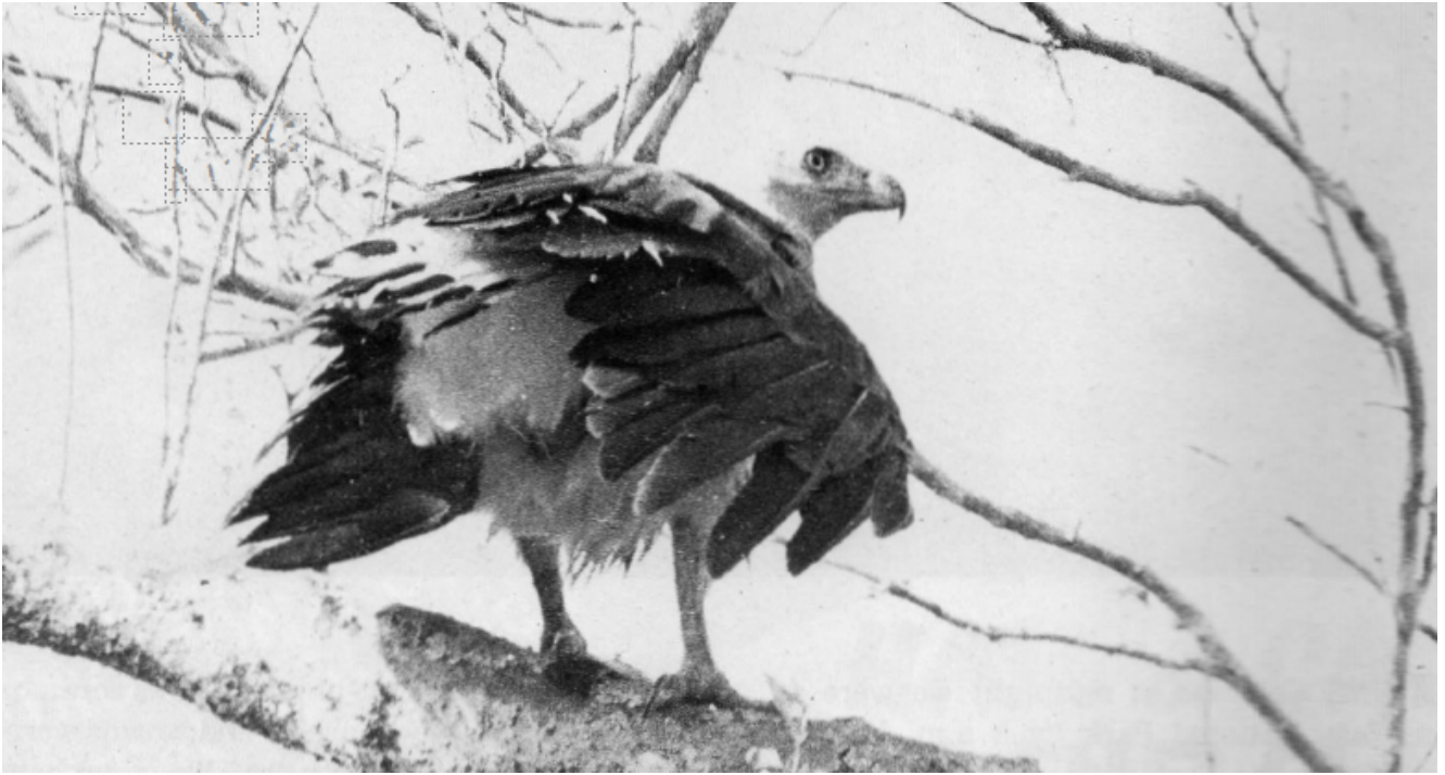
Scanning for Prey-A fishing Eagle or “Lool Maaralla” at Yala.