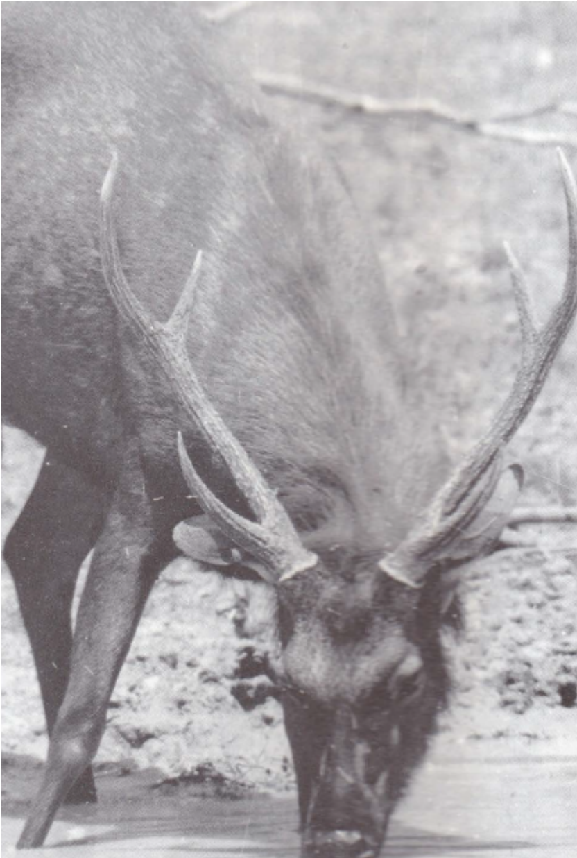
Sambhur at the water-hole.