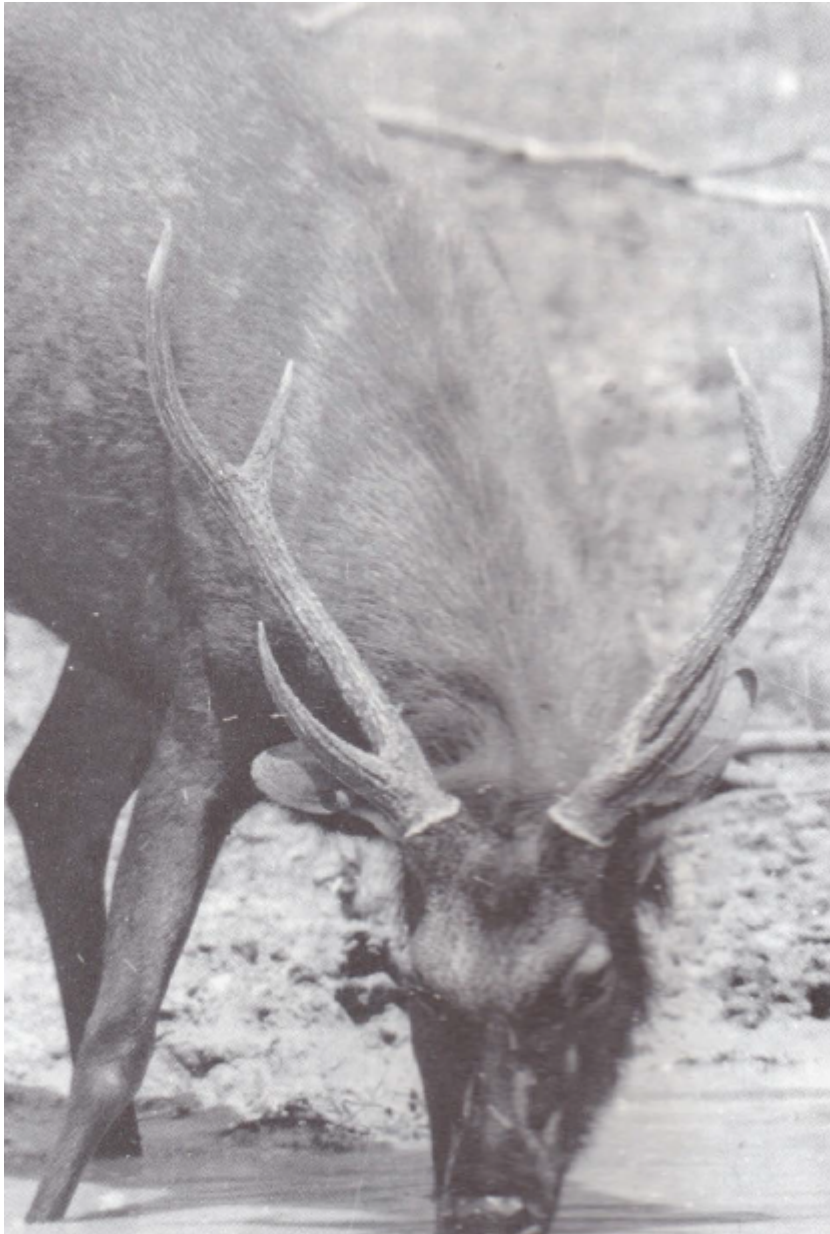
Sambhur at the water-hole.