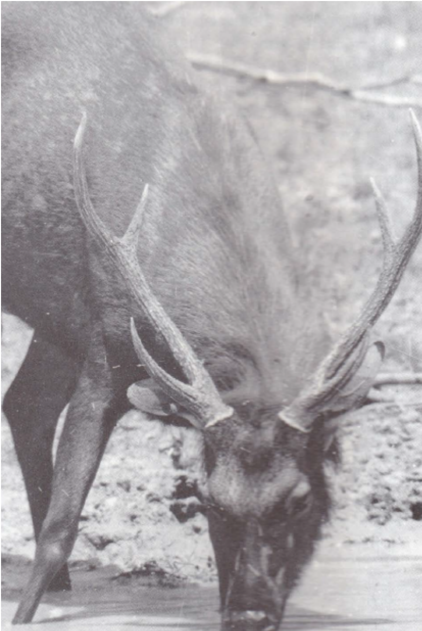
Sambhur at the water-hole.