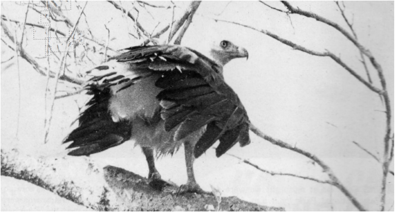
Scanning for Prey-A fishing Eagle or “Lool Maaralla” at Yala.