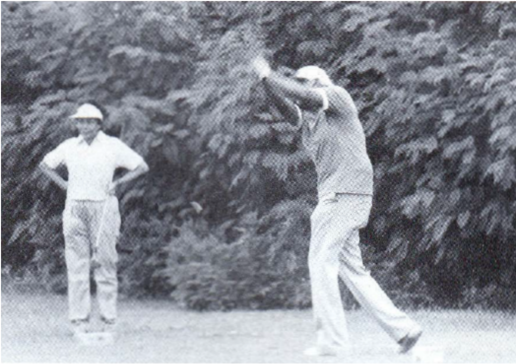
Driving at the Royal Colombo Golf Club.