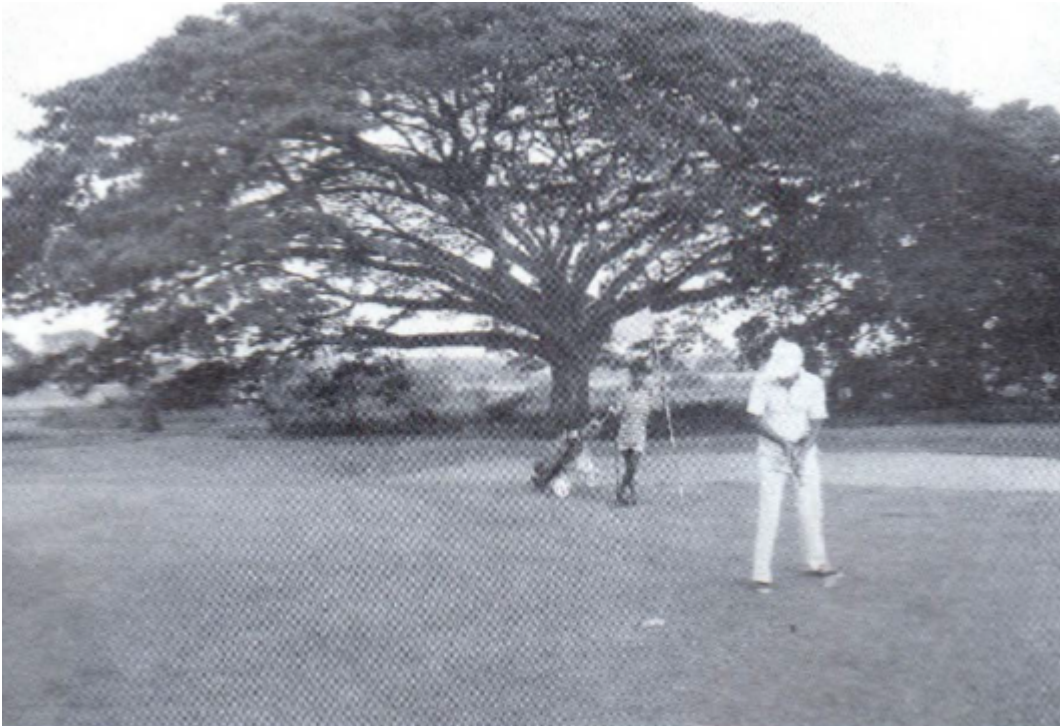
A fine putt near one of the many large trees char add beauty to the Colombo Golf course.

enthusiasts and Galle Face suffered encroachments and grew into a public promenade, the Golf Club was shifted to its present site on Model Farm Road, which at the time was largely a preserve of the European community with just a sprinkling of Ceylonese matter which has changed for the better today, with players both Sri Lankan and foreign in generous proportions using the course. The Sri Lankans are in the main the regular members of the Club,, while a large number of foreigners are those on short business visits, expatriate employees, or tourists on short holiday.