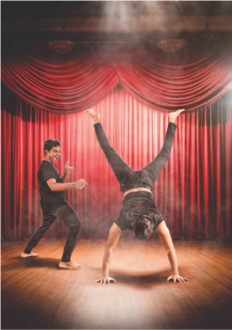
Rehearsing for Fresher's Night!