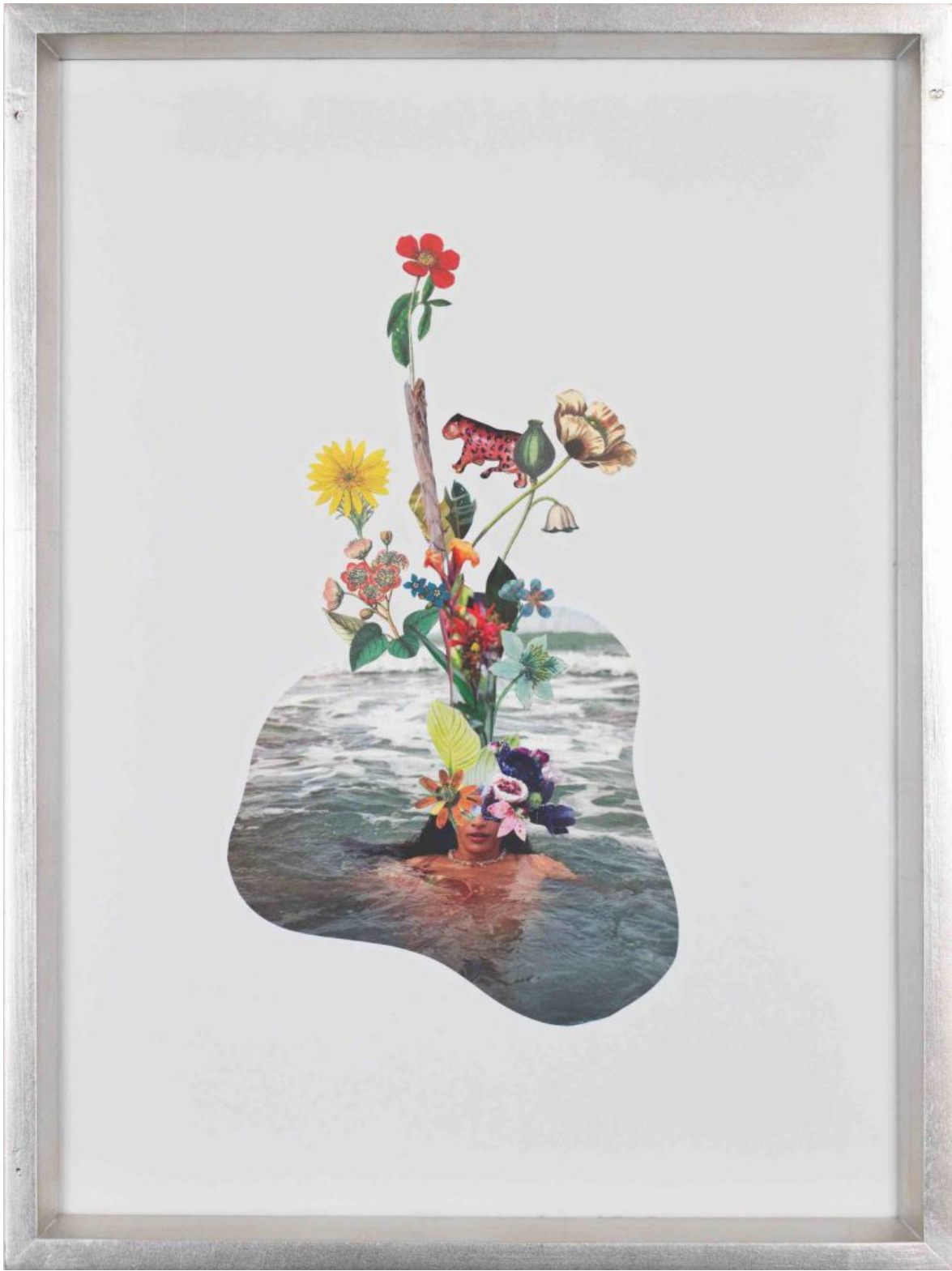
Ekin Su Koc (Ophelia Swimming).