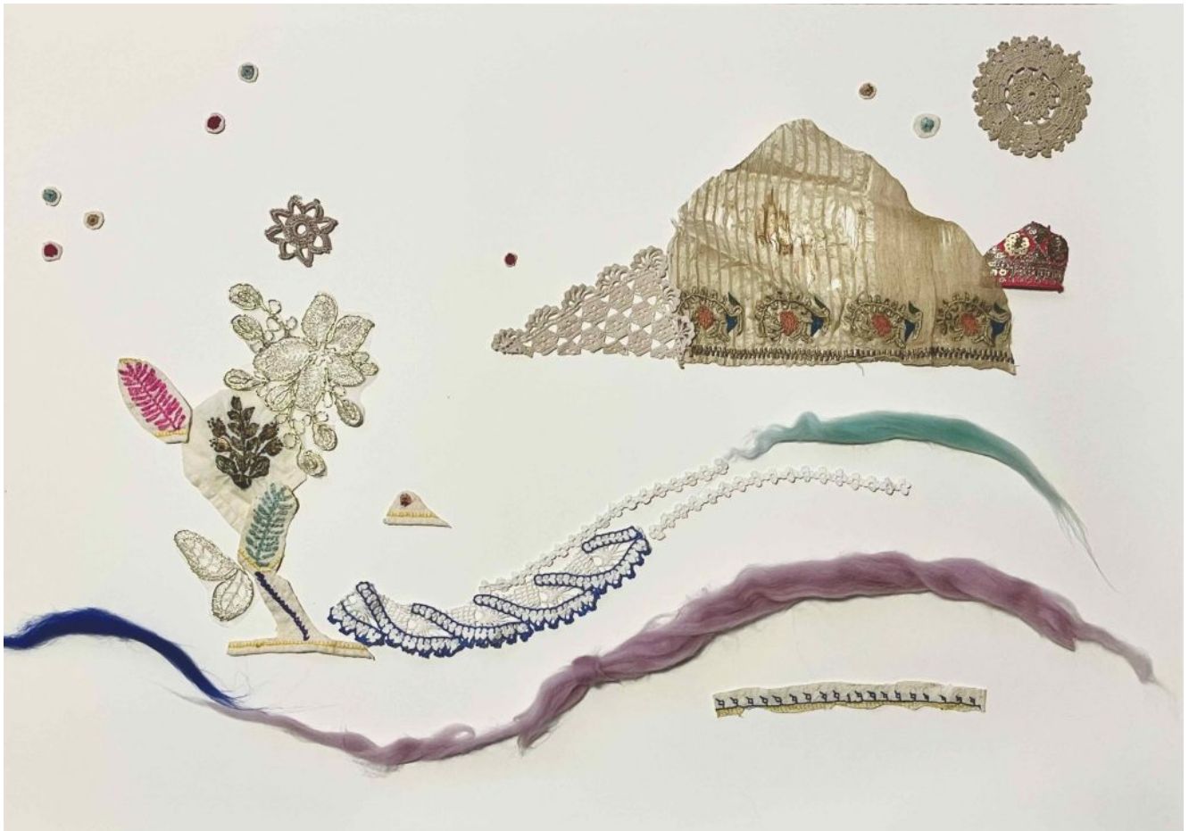
Ekin Su Koc (Some road and mountains at nowhere).

Tuğçe Diri predominantly engages in the realms of artisanal practices and ancient craftsmanship, which she traces in modern day Turkey. The Artisanal Tile series specifically reiterates the colors of traditional tiles mapping them on to abstract landscapes of the metropol Istanbul. Deeply concerned with the impact modern day lifestyles have on the city's ecosystem and the life of its inhabitants, Tugce Diri traces what remains of the past and what needs to be preserved to maintain a sustainable present.