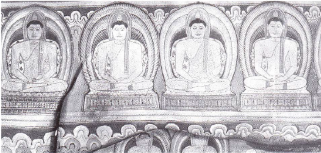
A section of the 1,800 square metres of painted rock wall at Dambulla. (Gamini Jayasinghe)

Over 1,800 square metres of painted walls and ceilings constitute the interior of these giant caves. These paintings retouched, redrawn, repainted, for the last time in the 18th C, are still as fresh and alive as they were 200 years ago. These 161 sculptured images and figures of the Buddha, Bodhisatva, Gods and Kings in the caves whose walls are also packed with beautiful murals are no doubt a rare find anywhere. The themes of the paintings include the Jataka Stories (Stories pertaining to the earlier lives of the Buddha), and significant events in the history of Sri Lanka such as the arrival of the first Sinhalese in Sri Lanka and the famous battle for supremacy between Sri Lankans and South Indian invaders.