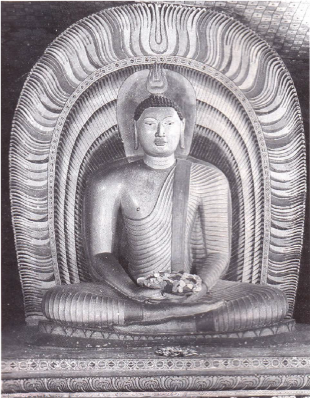
Seated Buddha in Dhyanamudra, the attitude of meditation with the bands in the lap, at Dambulla.