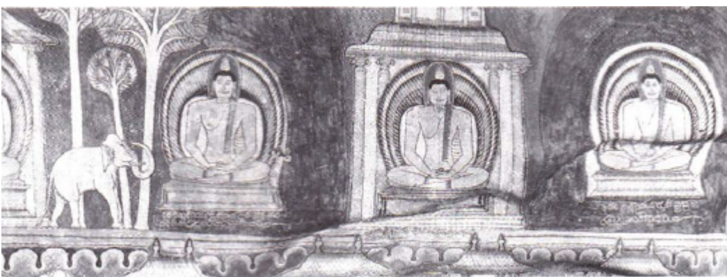
Paintings of the Rock Temple.- at Dambulla life of the Buddha.