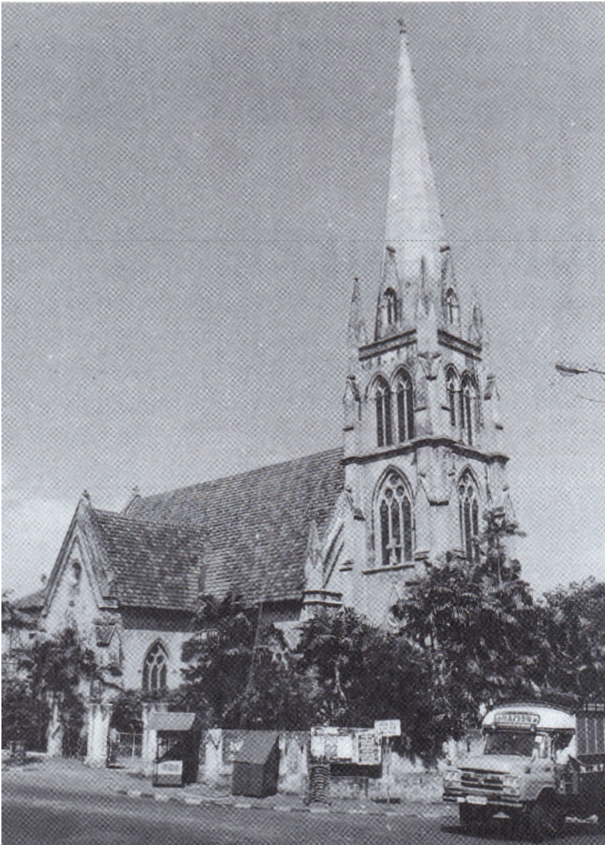
Spire of the Anglican Church at Hulftsdorp, near the Supreme Court.