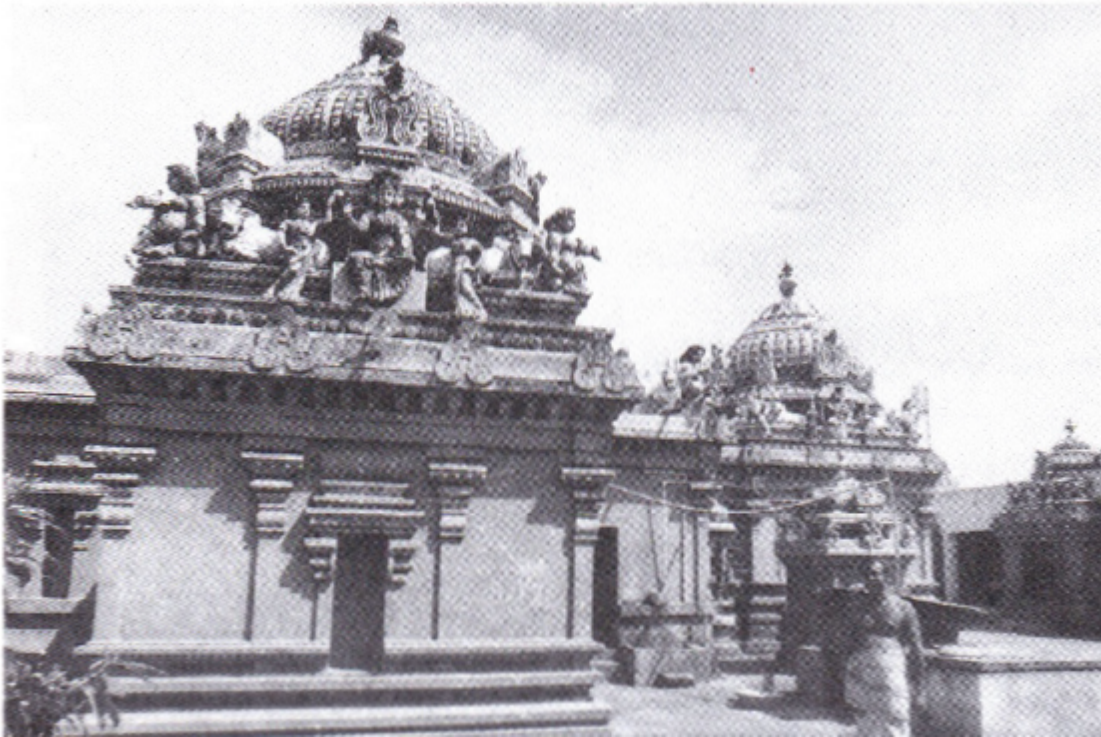
Hindu Kovil at Captains Garden. Colombo.

everyone joins in to help and share in the joy and naturally in the fun that follows.