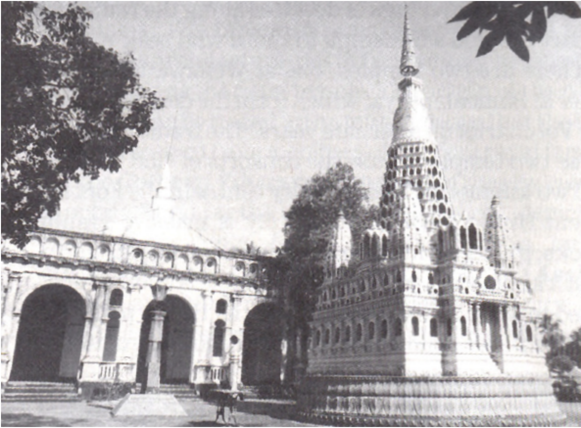
The Dipaduttaramaya, Kotahena, with its Siamese style dagaba.