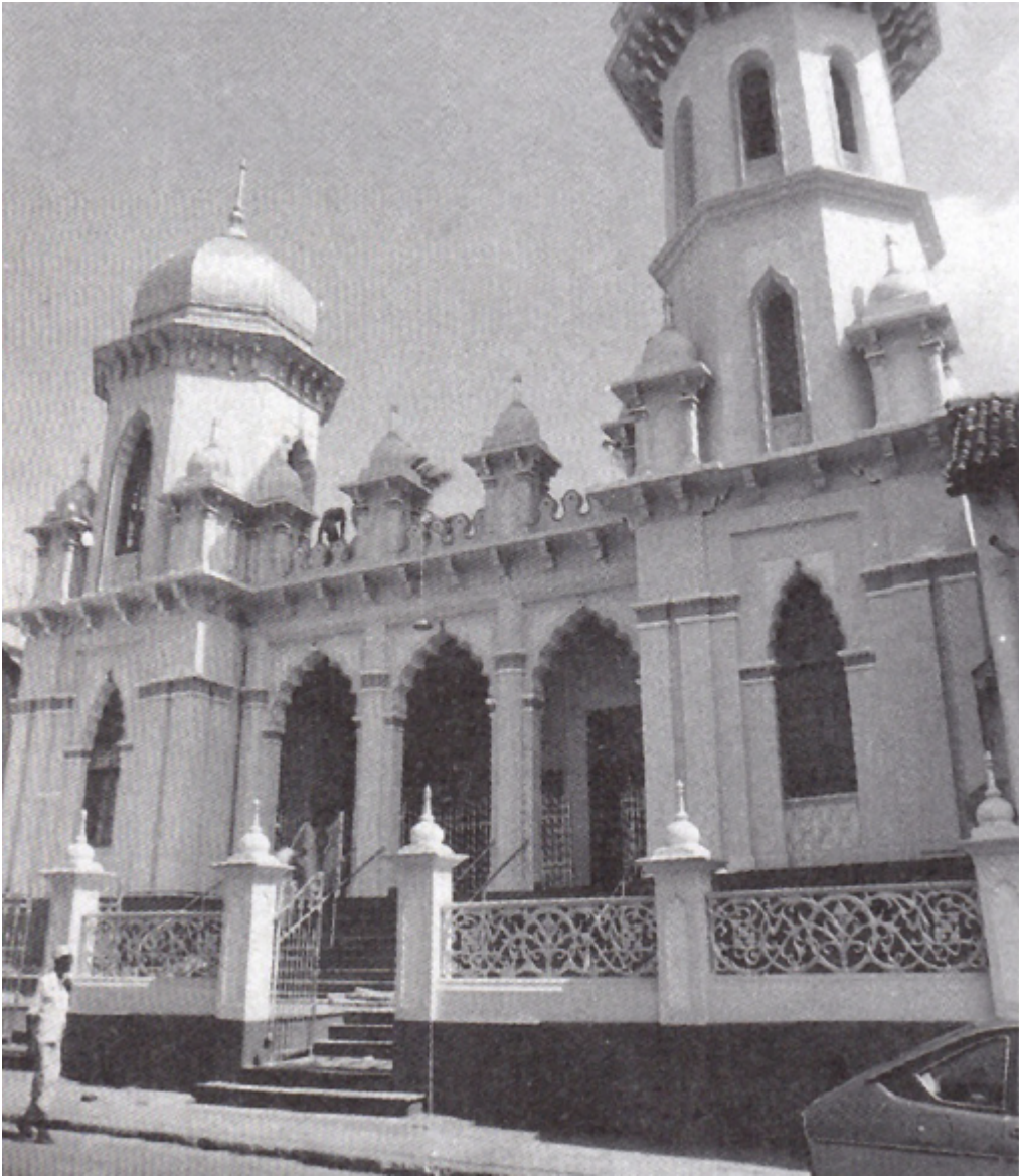
Mosque at Old Moor Street. Colombo