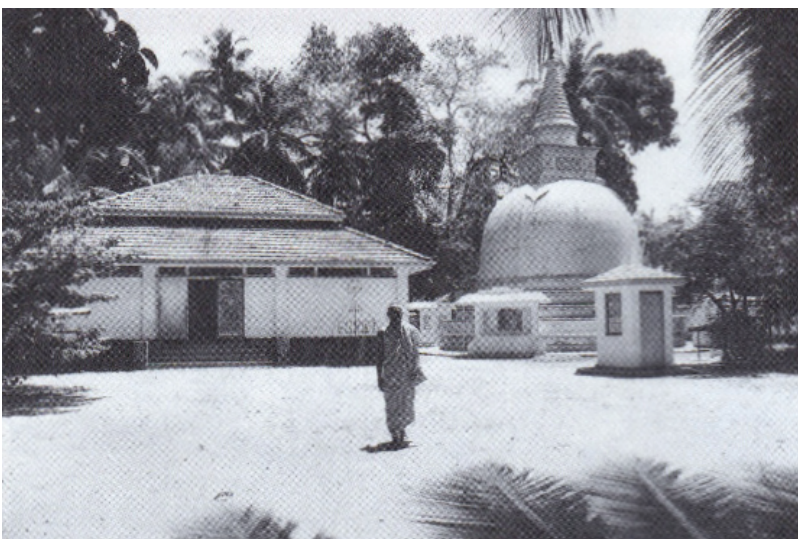
Typical Buddhist Temple in Colombo. This is the Gotami Vihara. Borella.