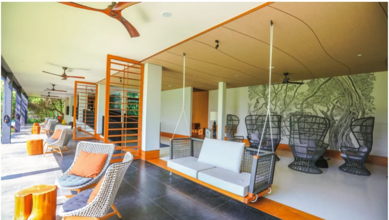
The lobby lounge is furnished with cooling and subtle shades.