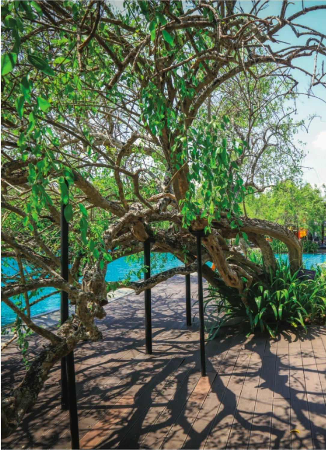
The restored tree held up with steel crutches.