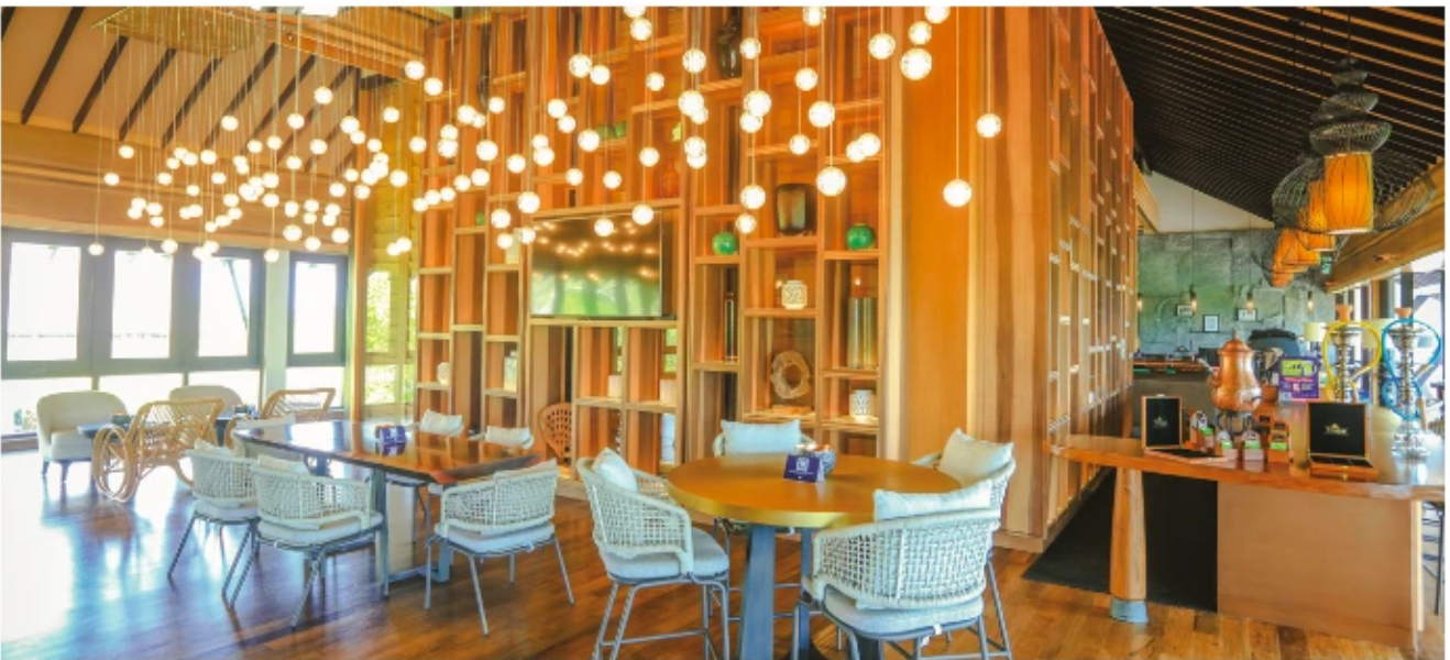
Turnstone, the main bar of the resort.