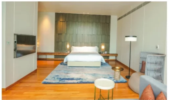
Another room of the Presidential Suite with a different interior.