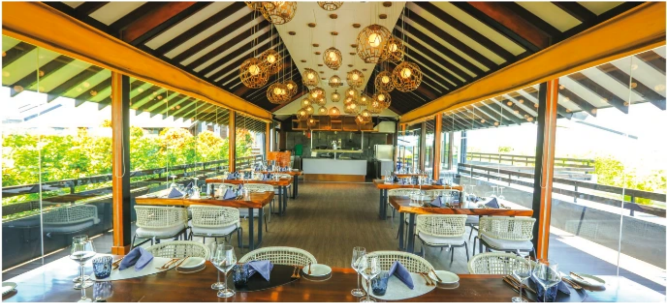
Redshank, the resort's signature seafood restaurant.