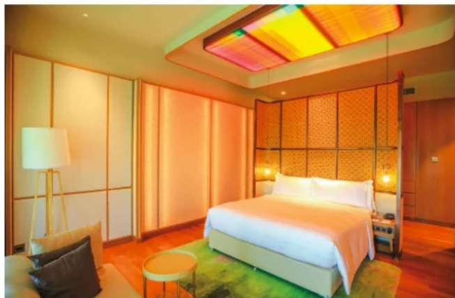
A Deluxe Double Suite.