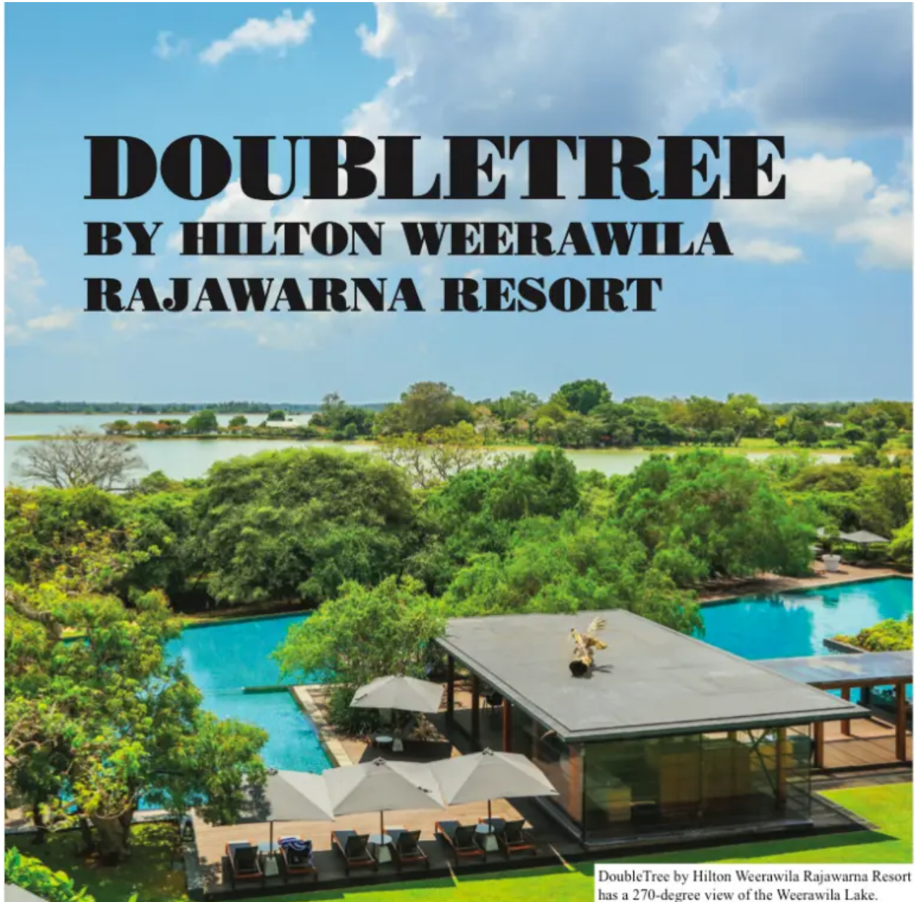
DoubleTree by Hilton Weerawila Rajawarna Resort has a 270-degree view of the Weerawila Lake.

The cooling breeze greets you, and the view of the Weerawila lake creates a mesmerizing sight. The lush greenery enhances the beauty and welcoming ambiance as you step into the DoubleTree