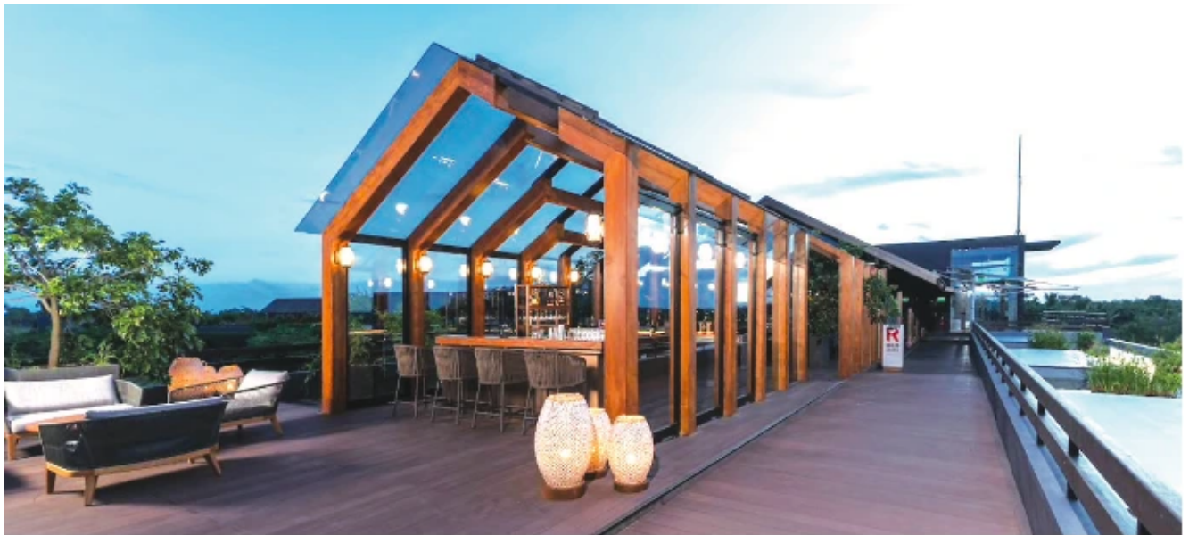
At dusk, Nightjar has a beautiful ambiance.