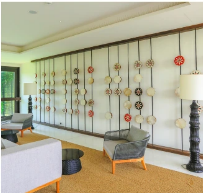
Above and below: Quaint spaces for guests to relax are adorned with Sri Lankan instruments.