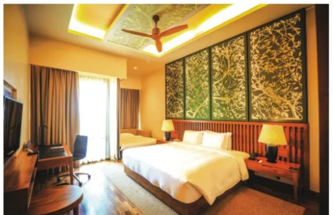
A Deluxe Room.