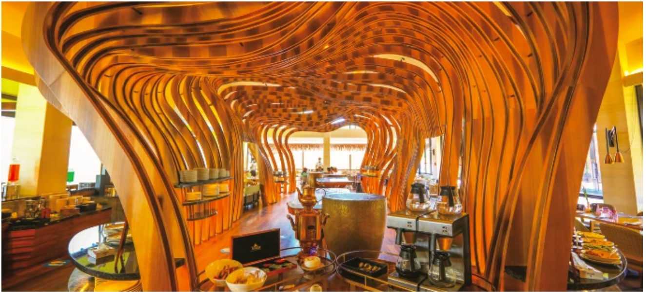
Spoonbill, all day dining restaurant, Tea Lounge and BBQ Grill.