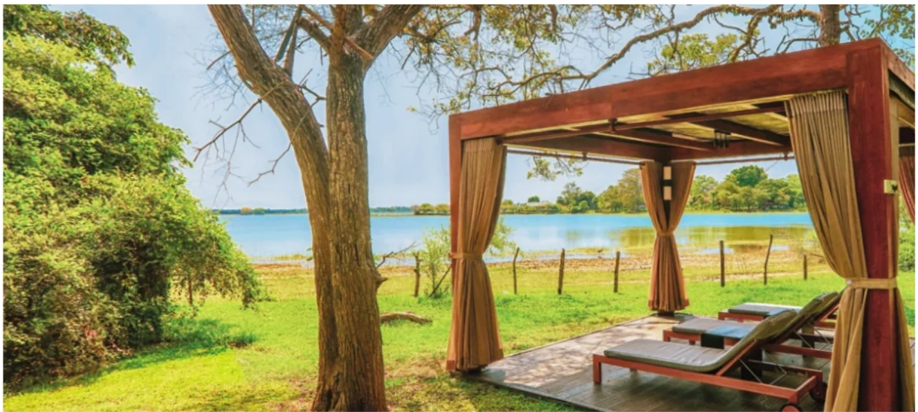
The comfortably furnished gazebos are named after birds.