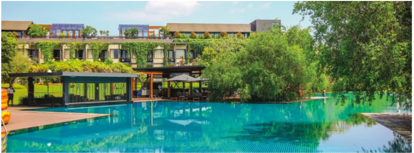
The 97m swimming pool has a unique shape as trees were incorporated into its design.