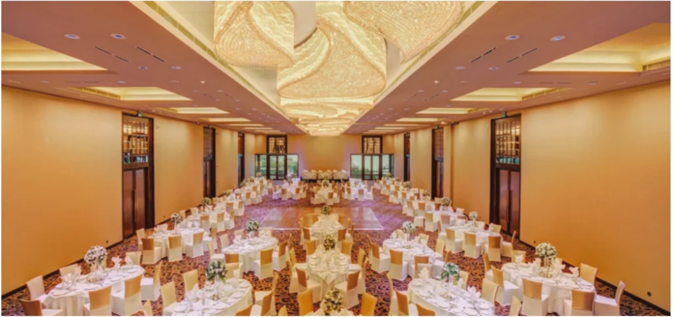
Grand Rajawarna provides banquet and conference facilities.