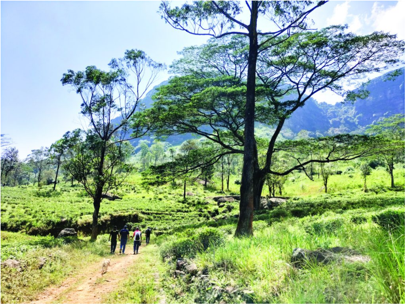
Stage 1 of the trail starts at Hantana and takes the hikers through lush, green landscapes.