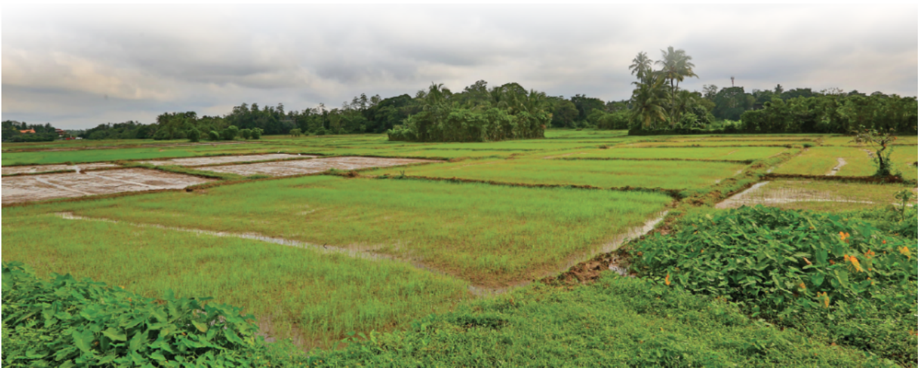
The lush green fields that stretches to the horizon are irrigated by the tank's water supply.