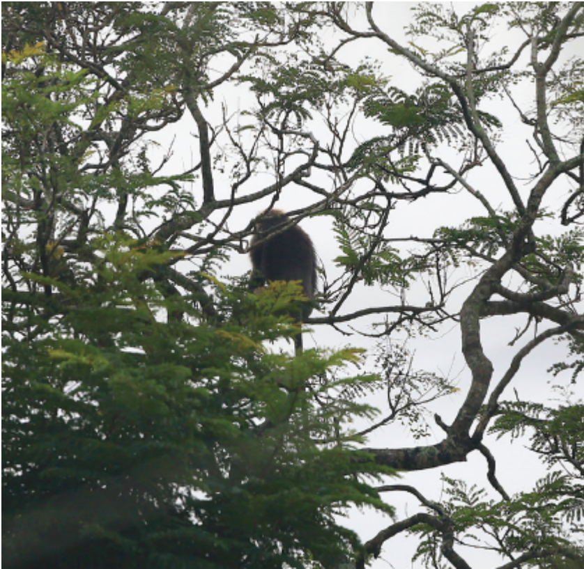
The nearby trees were a playground for a leaf monkey.