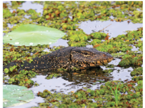
The greenery is the perfect cover for a water monitor