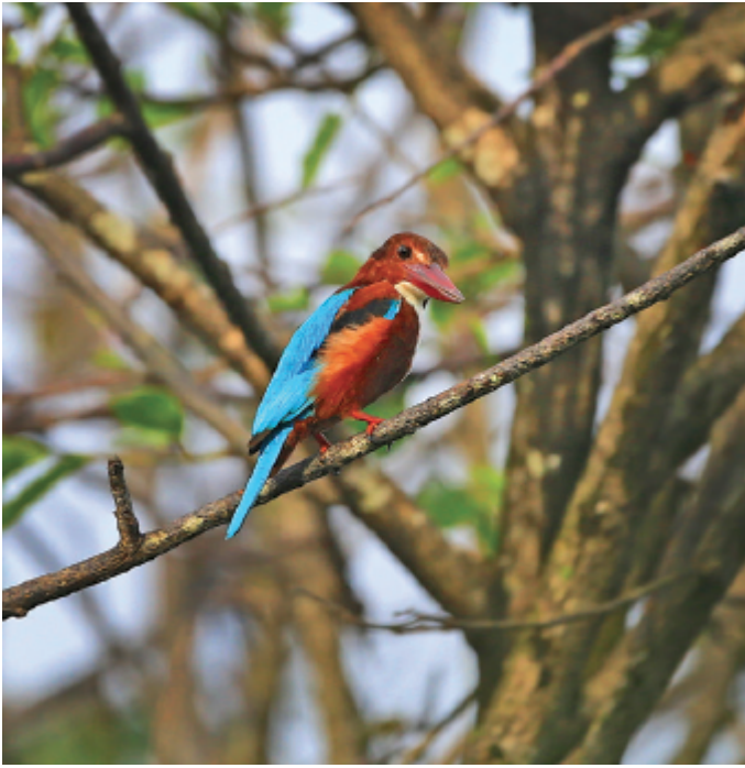
A Kingfisher on its hunting spot.