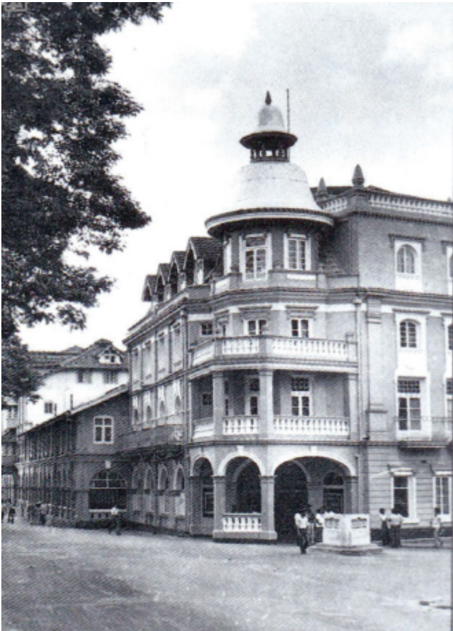
Queens Hotel at Kandy

The Ceylon Hotels Corporation (CHC), is the operator of 13 rest houses countrywide and four tourist class hotels.