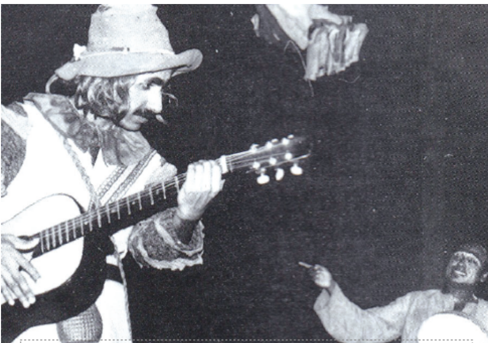
Did the Portuguese sing and dance before they gathered to partake of their Christmas dinner?