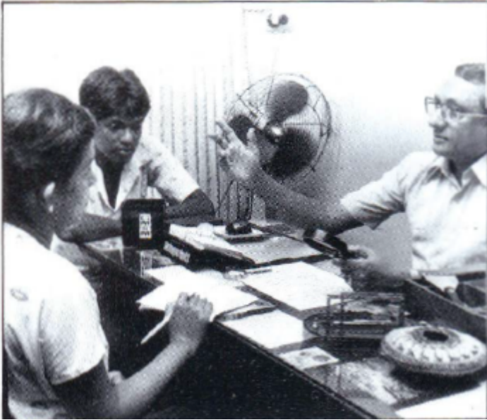
An expert reads from a carbon print of a palm.