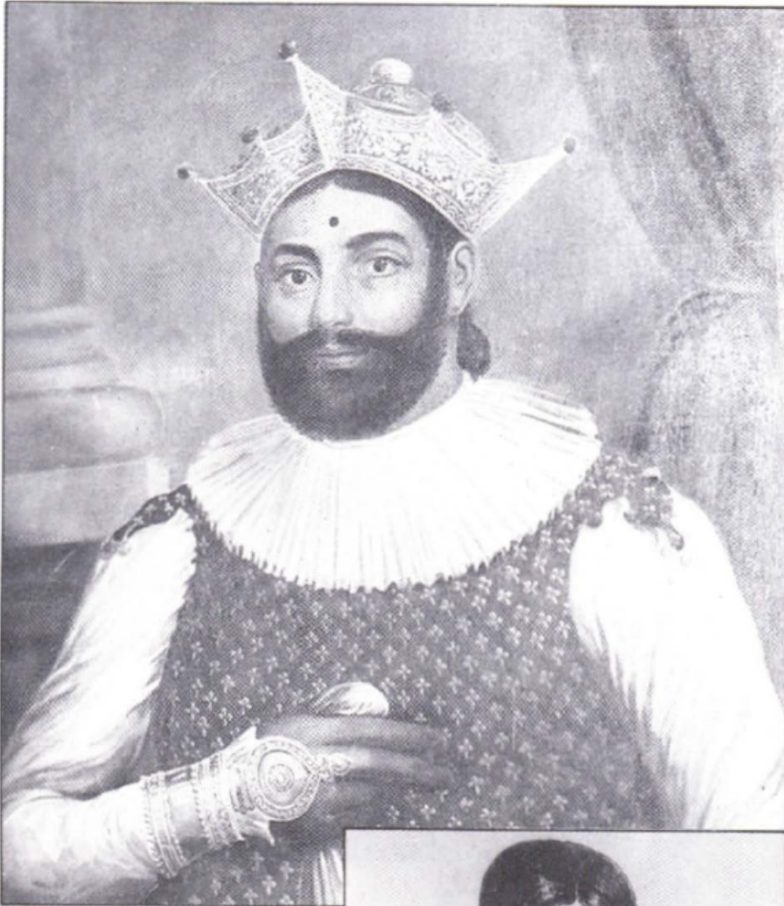
The last King of Kandy, Sri Wickrema Raja Singha, and his consort, Venkata Rangammal.