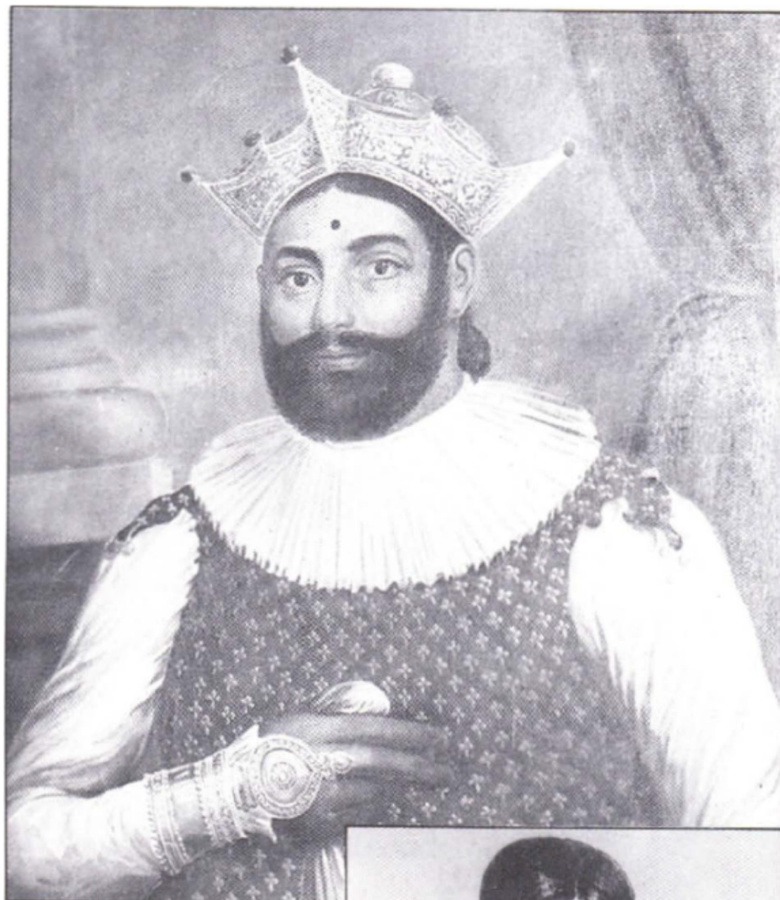
The last King of Kandy, Sri Wickrema Raja Singha, and his consort, Venkata Rangammal.