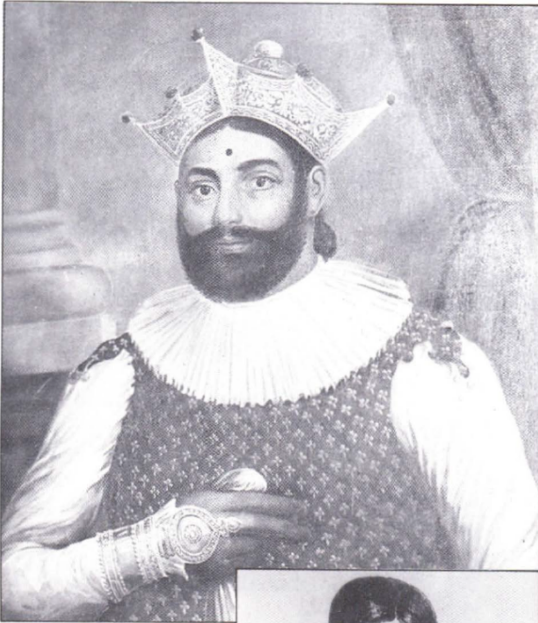
The last King of Kandy, Sri Wickrema Raja Singha, and his consort, Venkata Rangammal.