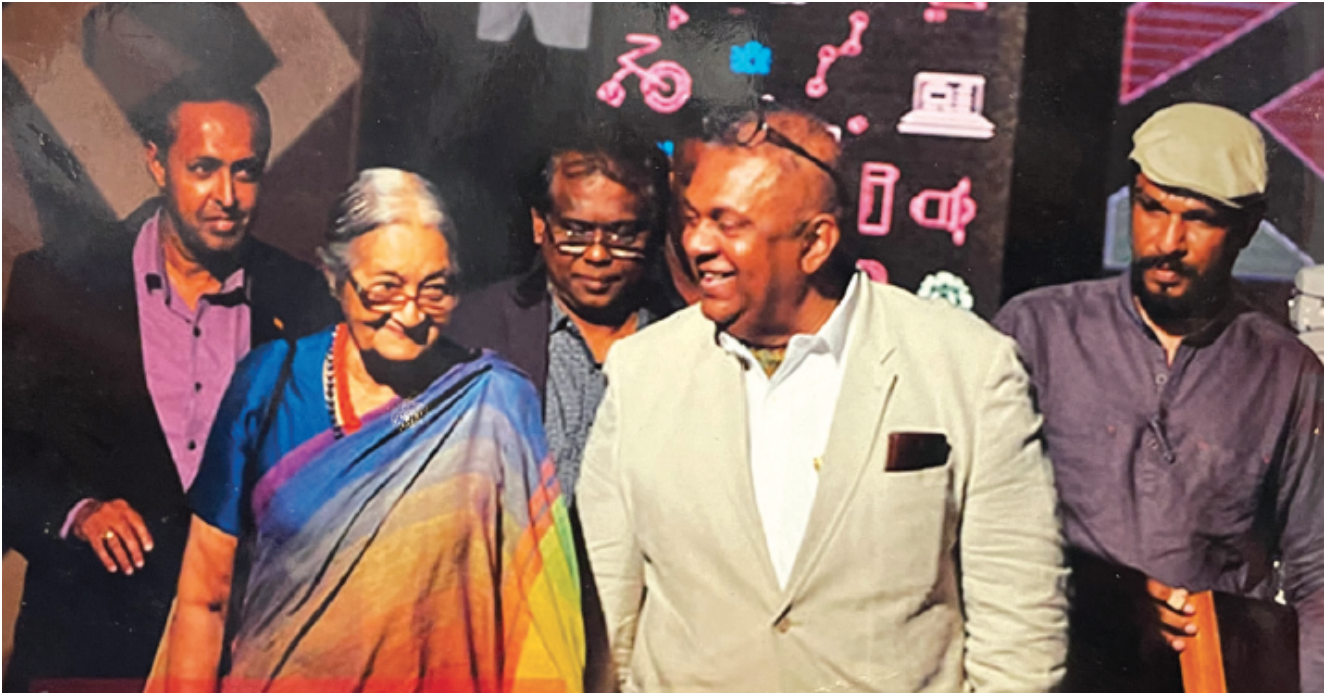
Walking back after receiving the lifetime contribution award from the Department of Integrated Design of the University of Moratuwa in 2018, from her friend, the late Minister Mangala Samaraweera and Officials of the University of Moratuwa.