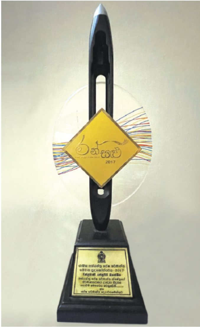
The award of recognition given by the Department of Textile Industry in 2017.