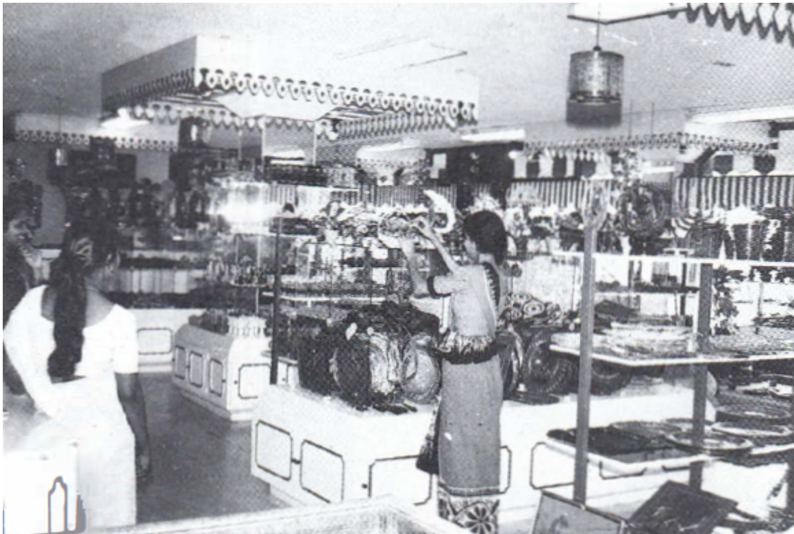
Interior of the Sri Lanka Handlooms Emporium.