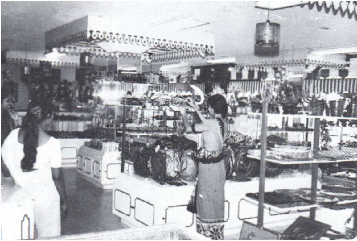
Interior of the Sri Lanka Handlooms Emporium.