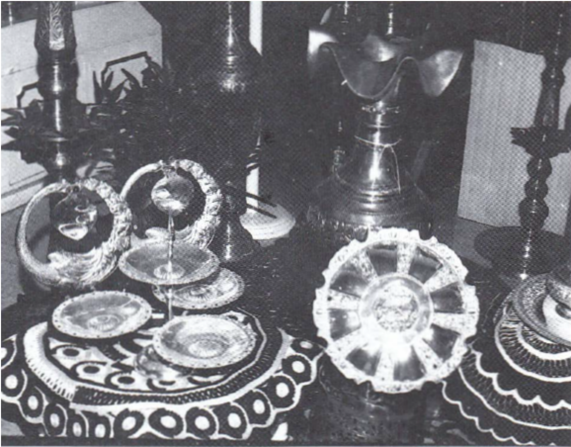
Ornamental ware in silver and brass.

while the object spins on a lathe. Heat caused by the friction melts the 'lac' into the object, making the colours fast. "Niyapotuveda" so called because the human fingernails is used in this method. The lac is drawn into a fine thread whilst still soft, laid carefully in the design desired, over a single background colour. The thumbnail is then used to work out the details.