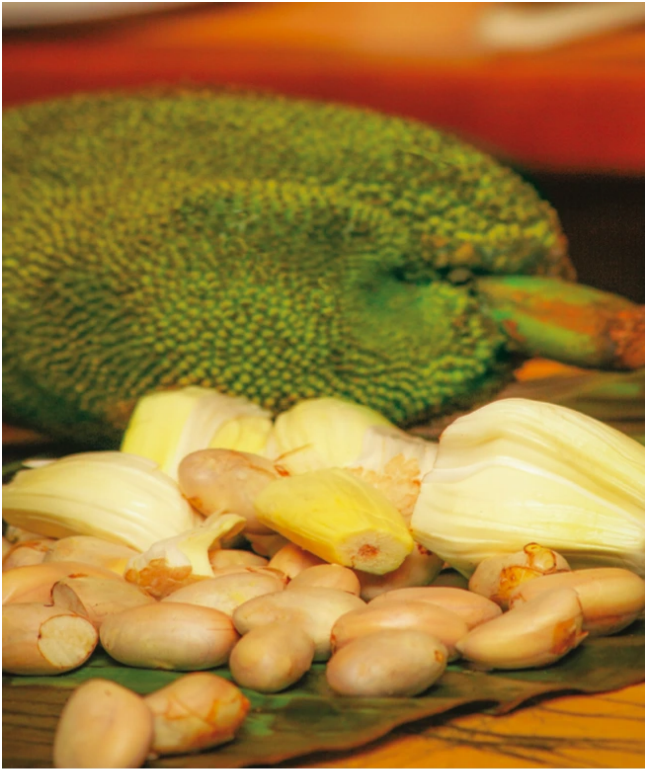
Jackfruit seeds (kos ata) like the flakes, can be cooked and prepared as a snack in many ways.