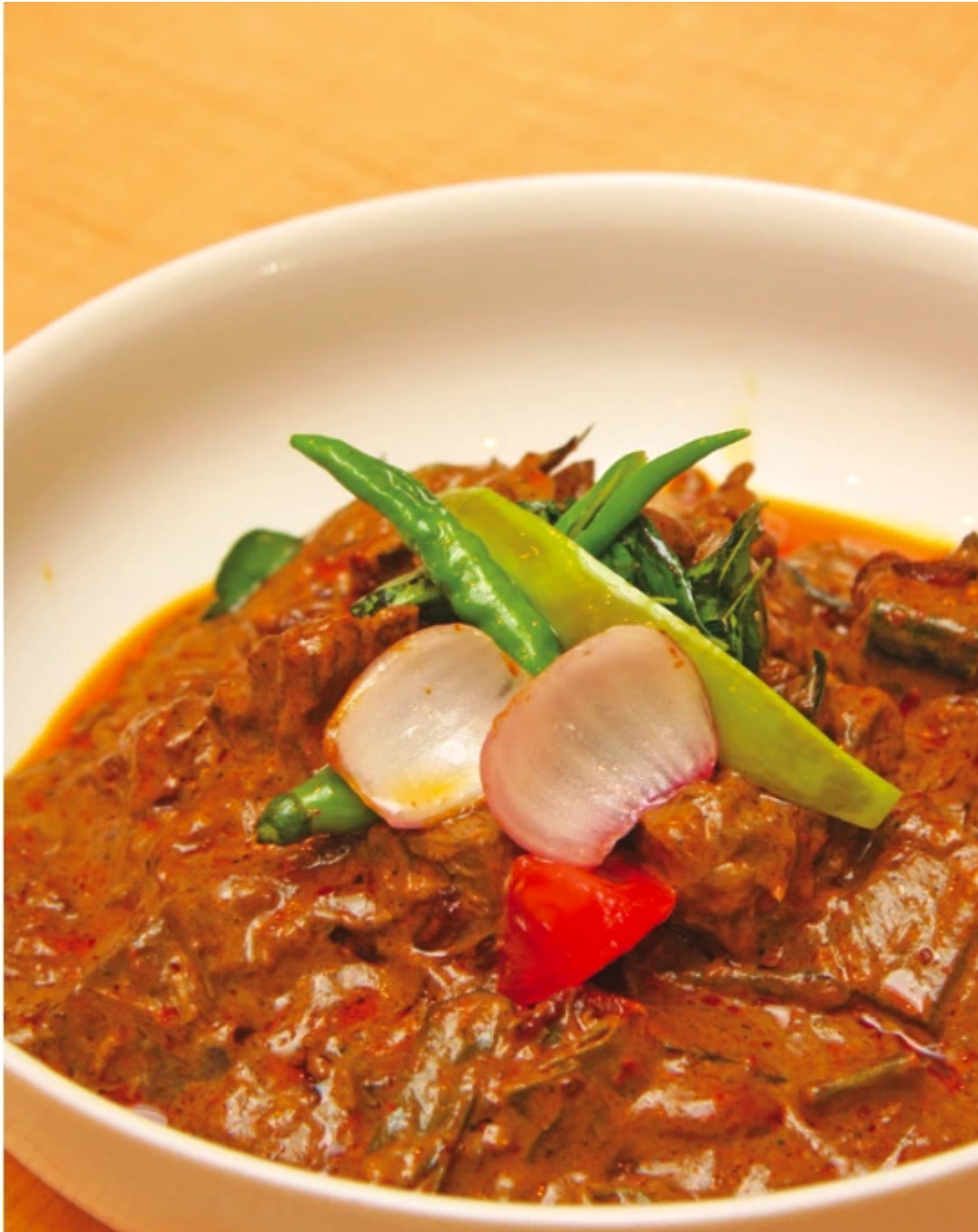
Red 'Polos' curry brimming with spices, herbs, and exotic flavors.