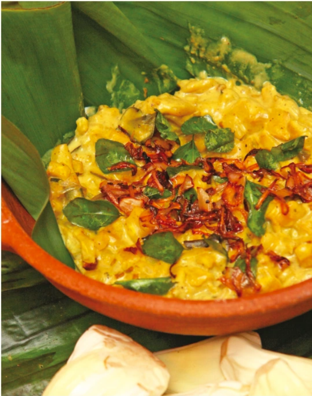
Kiri Kos is a mild and creamy accompaniment with rice.