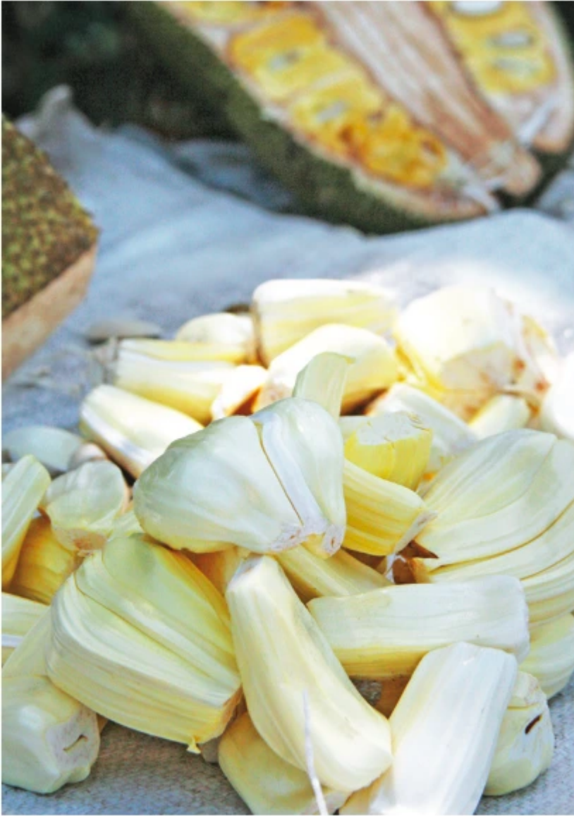
Jackfruit bulbs vary in size, shape, and texture.