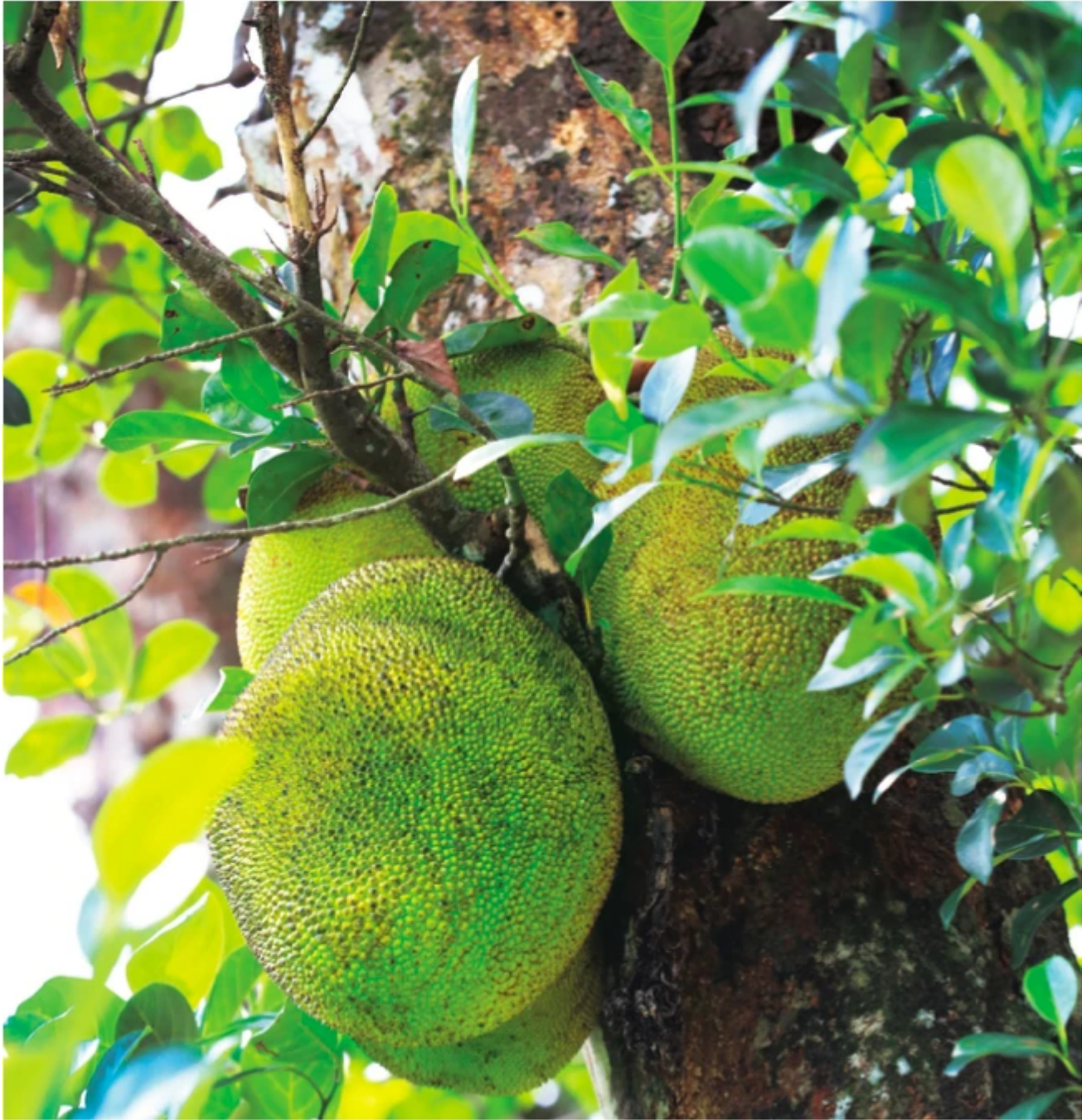
Sunlight is vital for the growth of a jack tree.