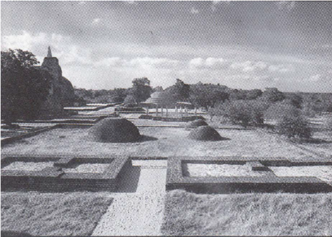
Alahana Pirivena (Polonnaruwa, 11th & 12th centuries): conserved monuments close to the Lankatilake and KiriVehera.