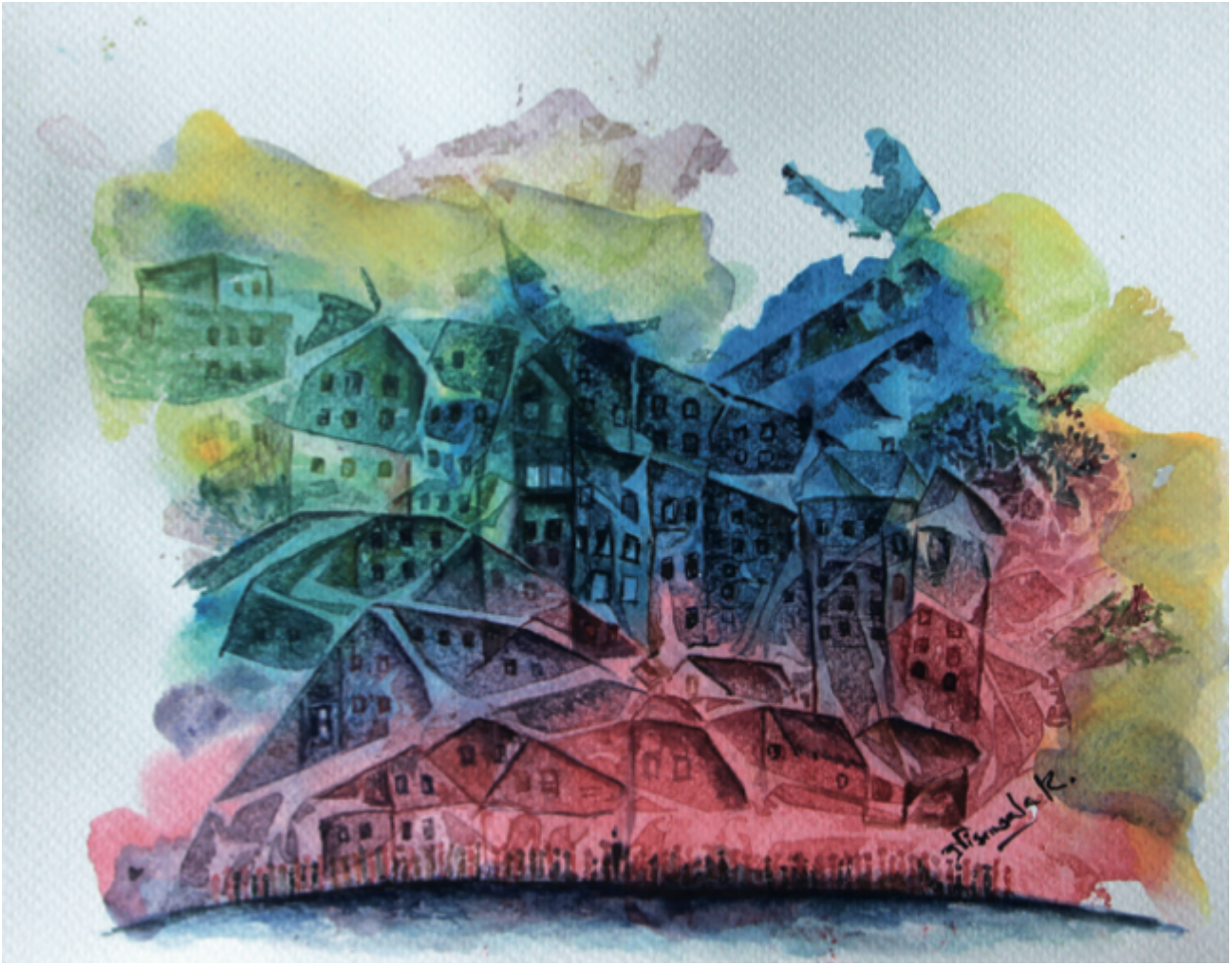
Dhaka City of Bangladesh - Watercolor on Paper.