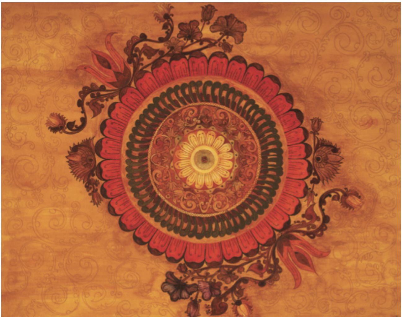
Thuwarala (A flower in heaven) - Watercolor on Paper.