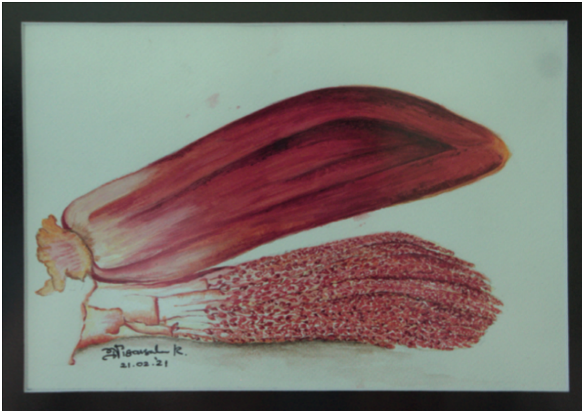
Ran Dothalu: rare endemic palm in Sri Lanka - Watercolor on Paper.