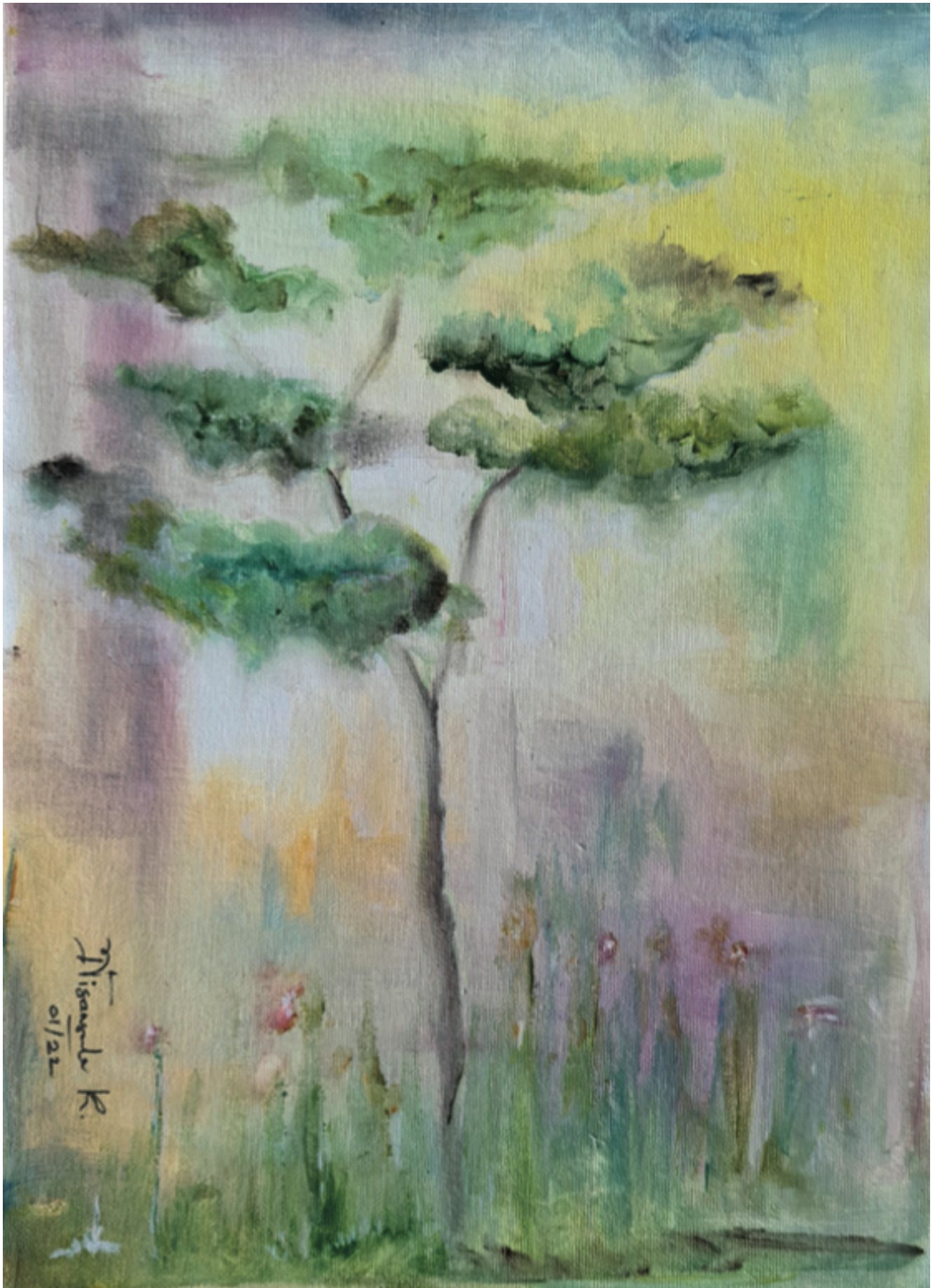
Tree at Paradise - Acrylic on Canvas.