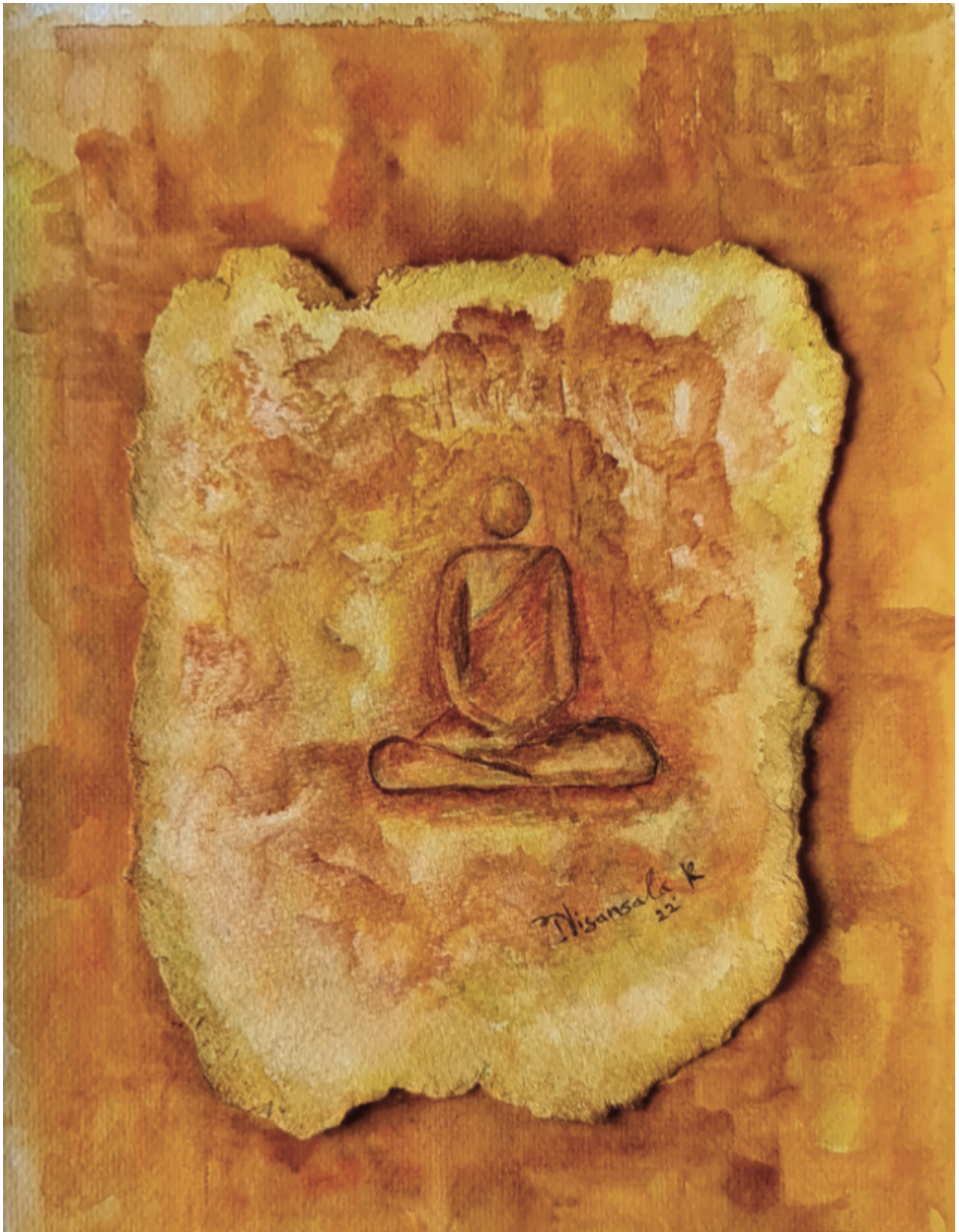
Viriya (Effort) - Watercolor on Paper.