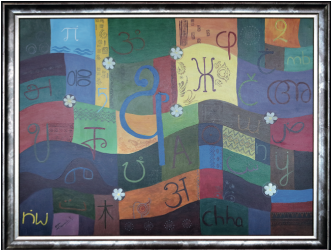
Global Harmony through Language & Culture - Acrylic on Canvas