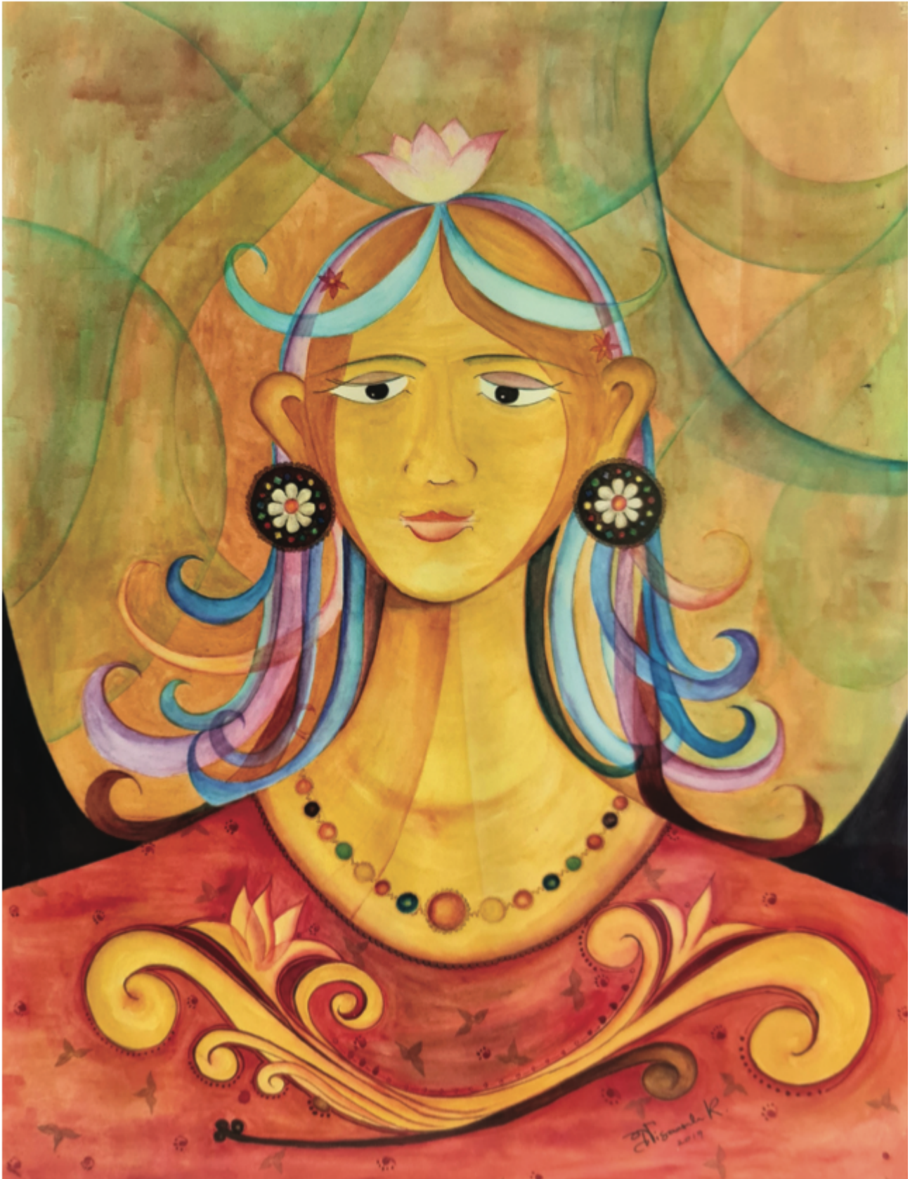
Princess - Watercolor on Paper.