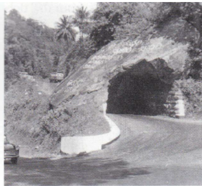
Kadugannawa Pass — cut through the rock. A constant reminder of British Engineering skills.