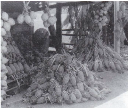
Kirillawela has wayside fruit stalls displaying luscious pineapples in heaps to catch the eye of the passing motorist.