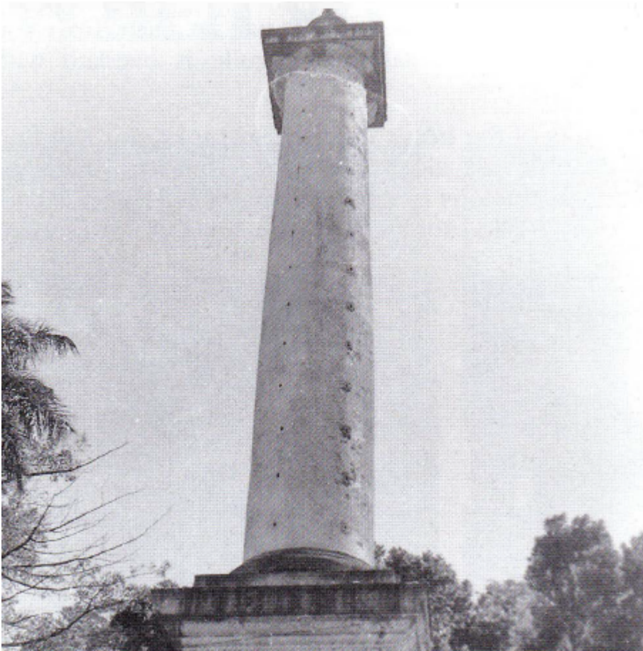
Dawson Pillar - built in memory of the British Engineer who, cut through sheer rock to build the road to Kandy.