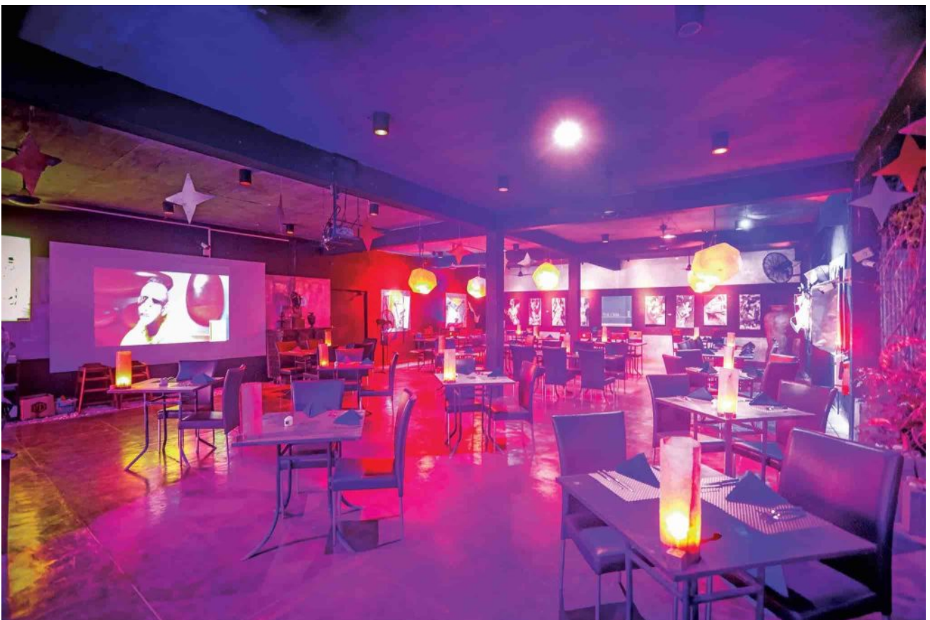
Stylish Oval restaurant is suitable for families and large groups.