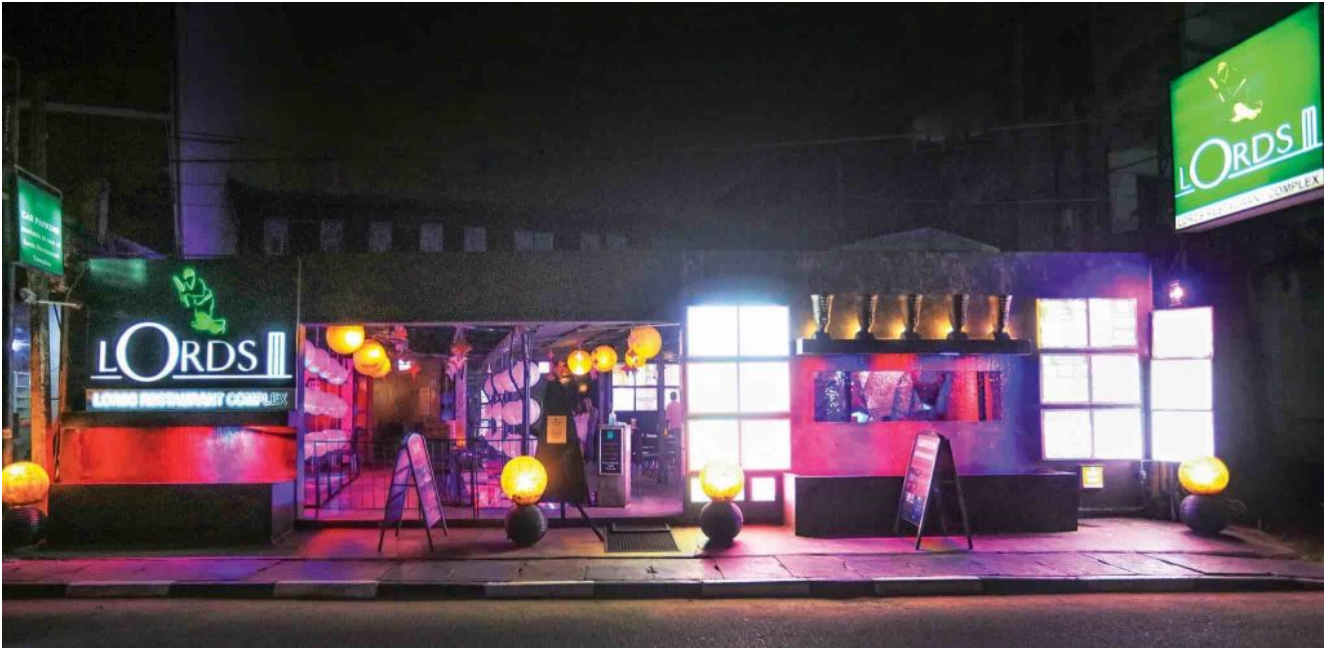
Lords, Negombo is all set up in full swing to serve its patrons again.