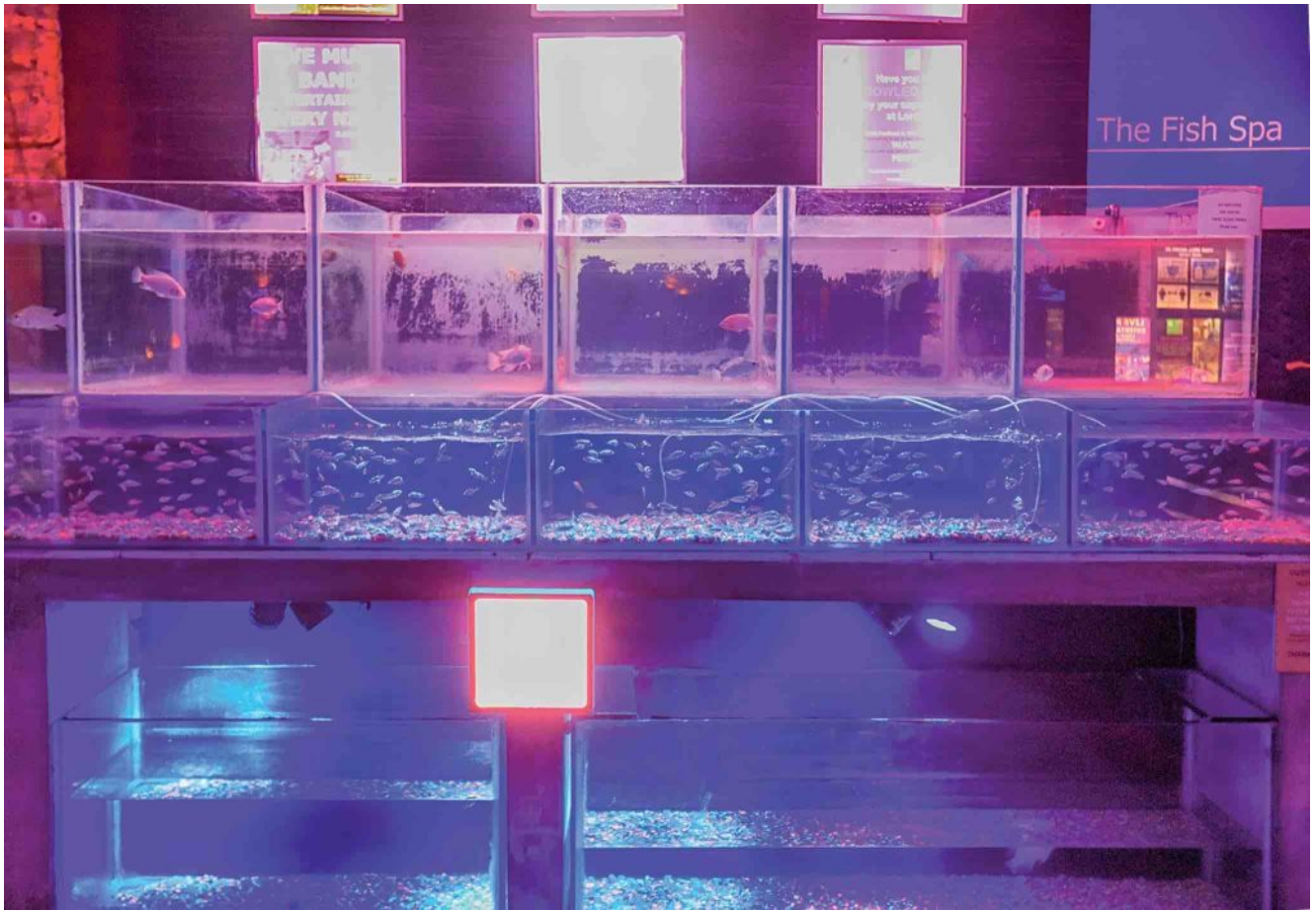
The Fish Spa section.