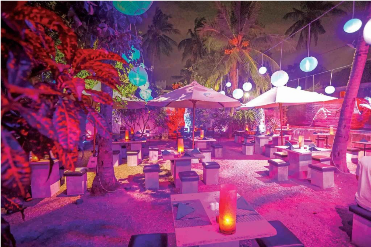
Dine under the stars at the Outdoor Boundaries Garden Restaurant and Bar.