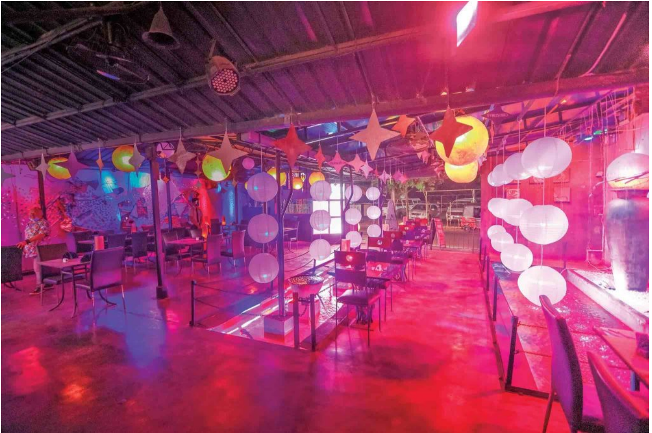
Batsman Restaurant with a quiet and romantic ambiance.