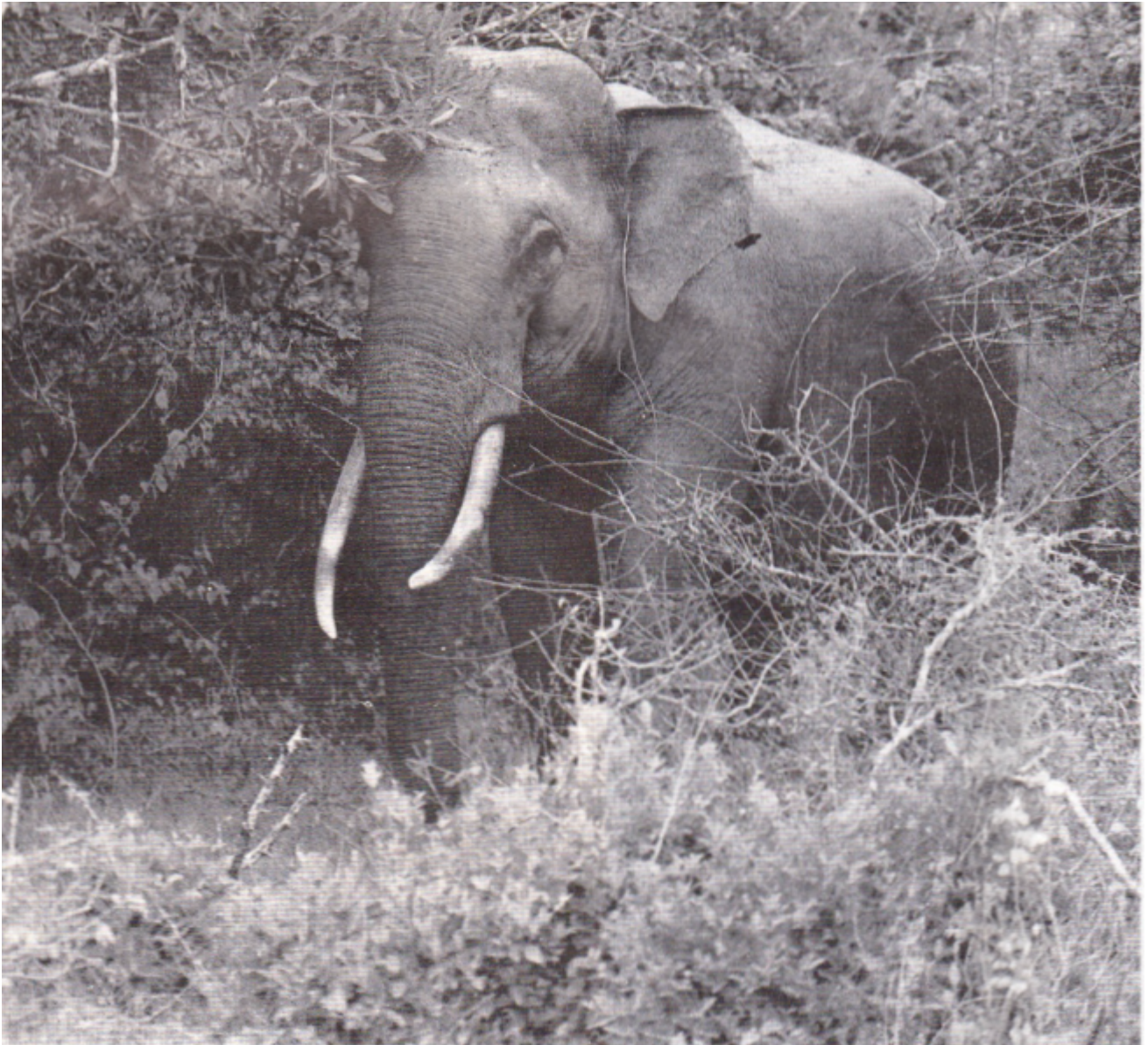
Tusker - a rare sight at Yala

his thirst, though unfortunately he never learned the art of closing it when he was done. Alas, both "Buttawa Bill" and "Yala Yokel" are no more.