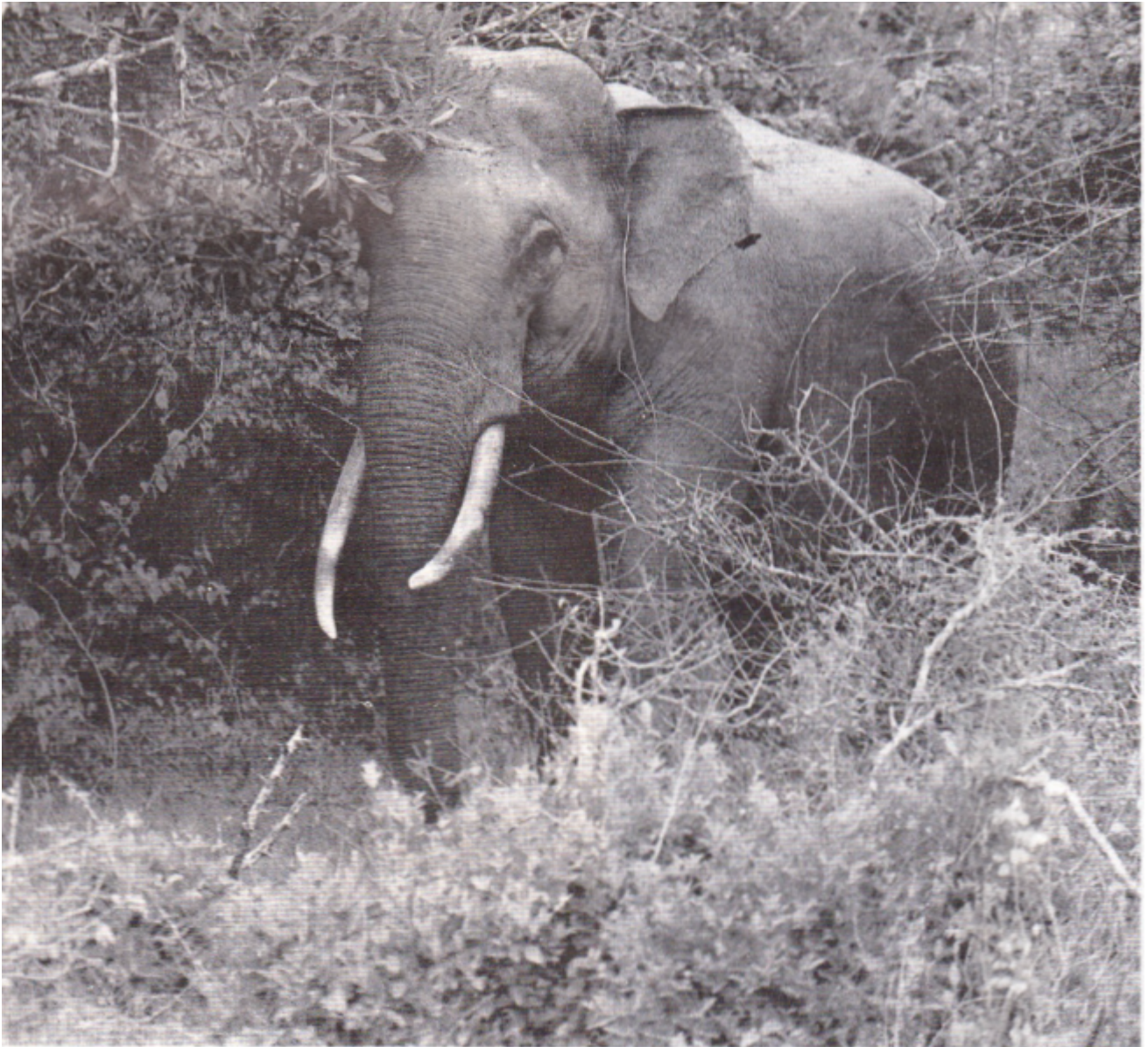
Tusker - a rare sight at Yala

his thirst, though unfortunately he never learned the art of closing it when he was done. Alas, both "Buttawa Bill" and "Yala Yokel" are no more.